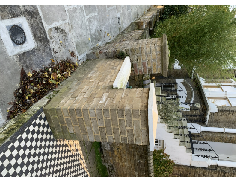
4. Front Garden Wall and Steps to Street PH-01