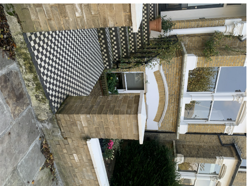
3. Front Garden Wall and Steps to Street PH-01