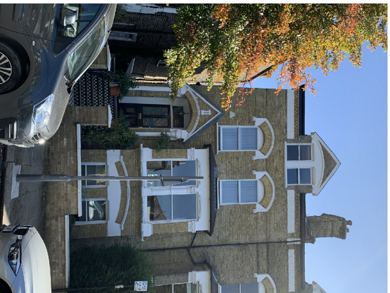
1. Front Elevation PH-01