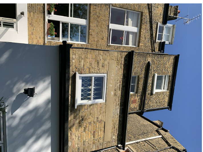
6. Existing two storey Extension PH-01