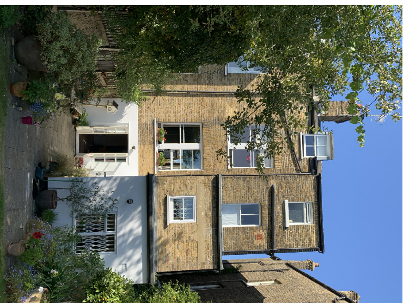
2. Rear Elevation PH-01