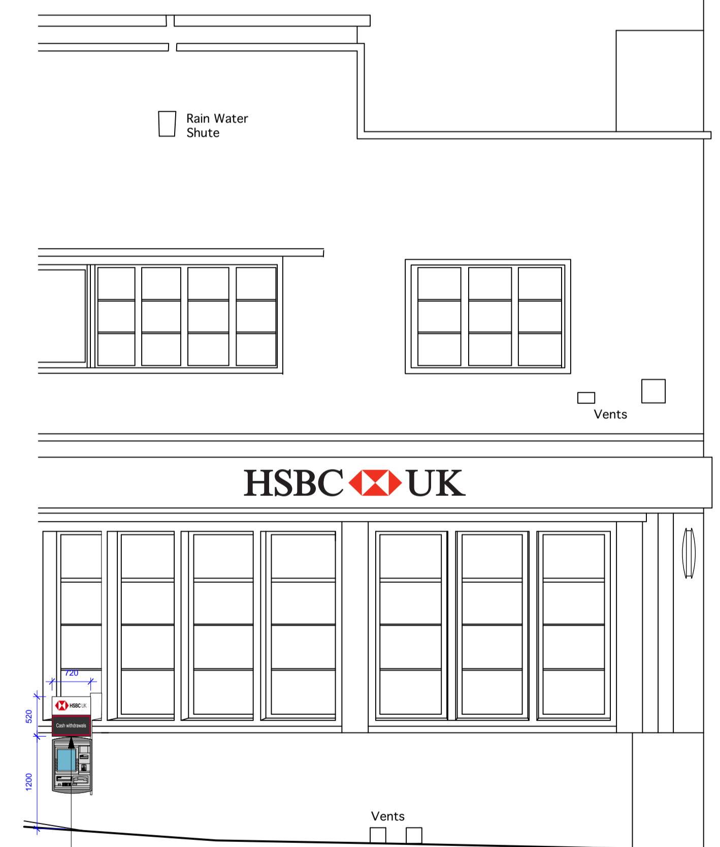
New ATM header sign to replace existing EAST ELEVATION