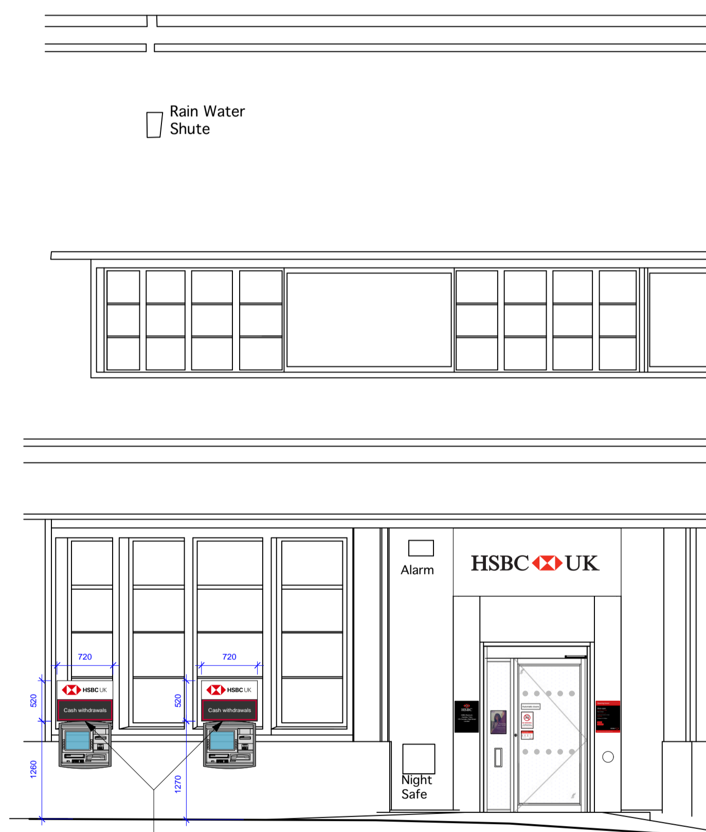
New ATM header signs to replace existing SOUTH ELEVATION