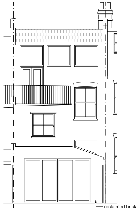
REAR ELEVATION (proposed)