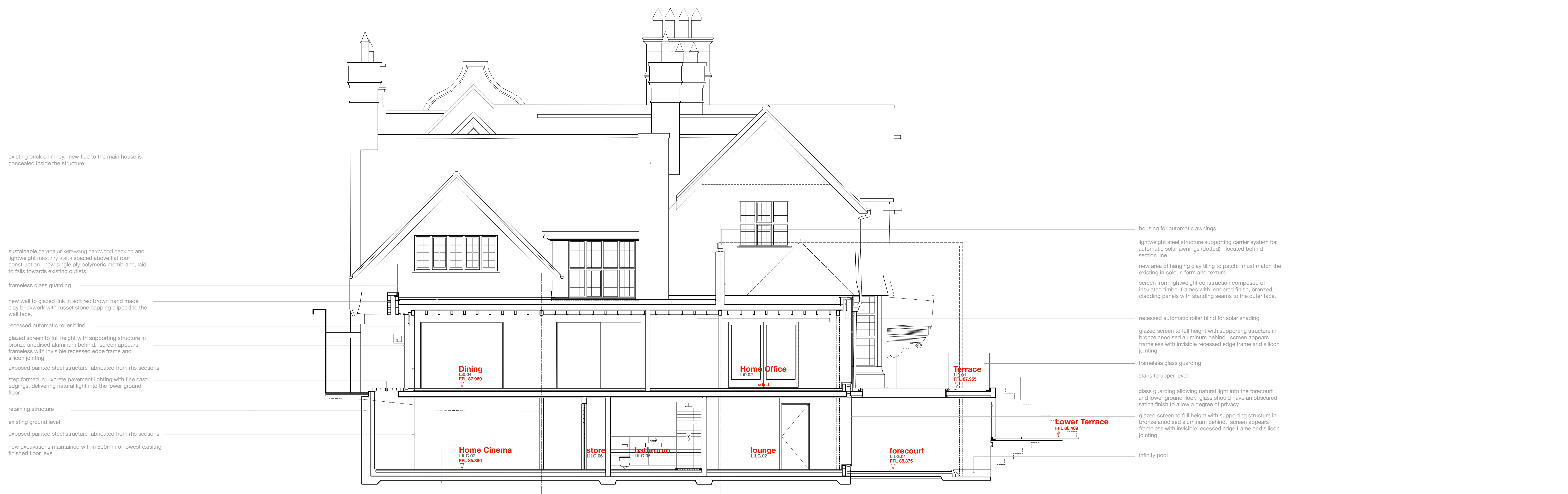
Section BB West