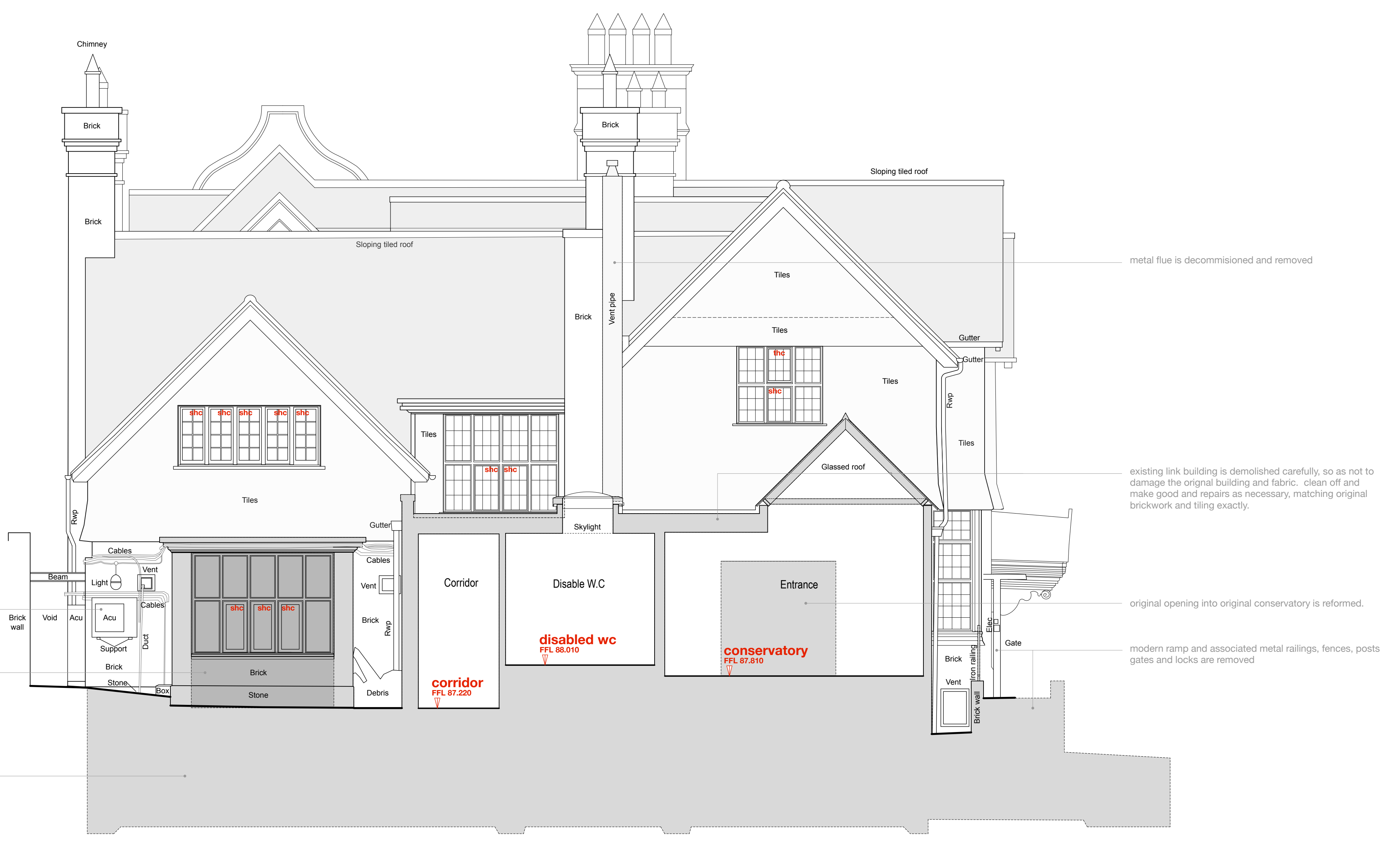
Section BB: West