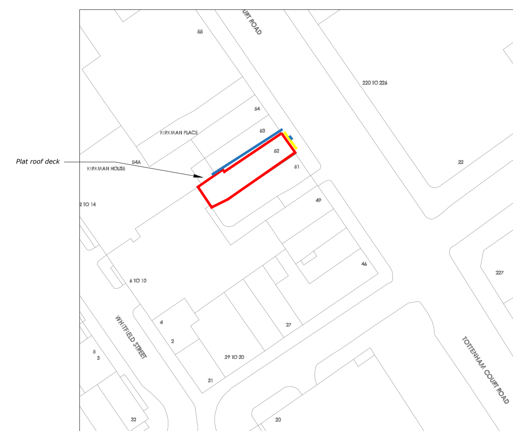
Location Scale 1:500 Metres