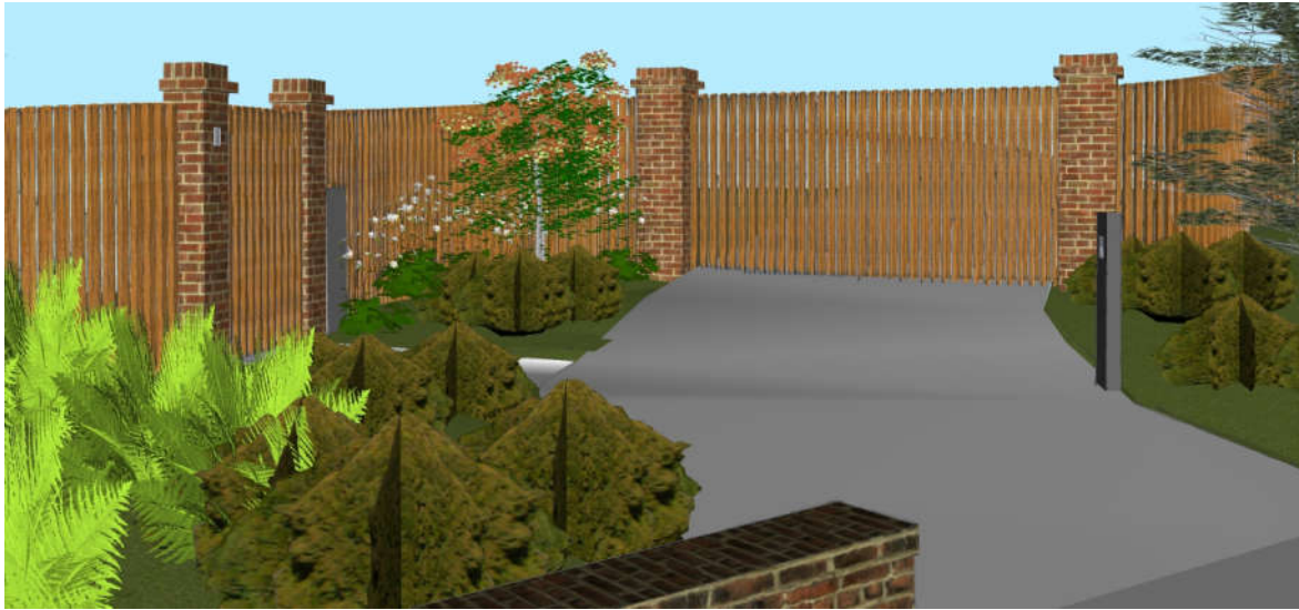
Front boundary fence design showing gate piers (driveway right and pedestrian left)