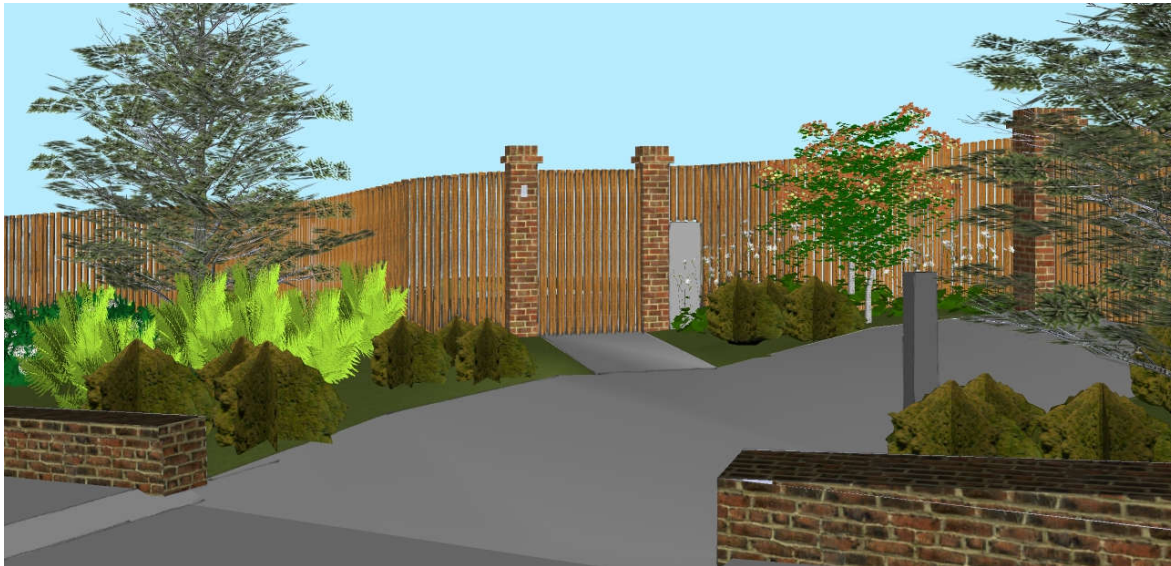
Front boundary fence design showing pedestrian gate piers (centre)

Schematic design showing gate piers at 2.062m high (Three brick courses above the permitted fence height of 1.8m)