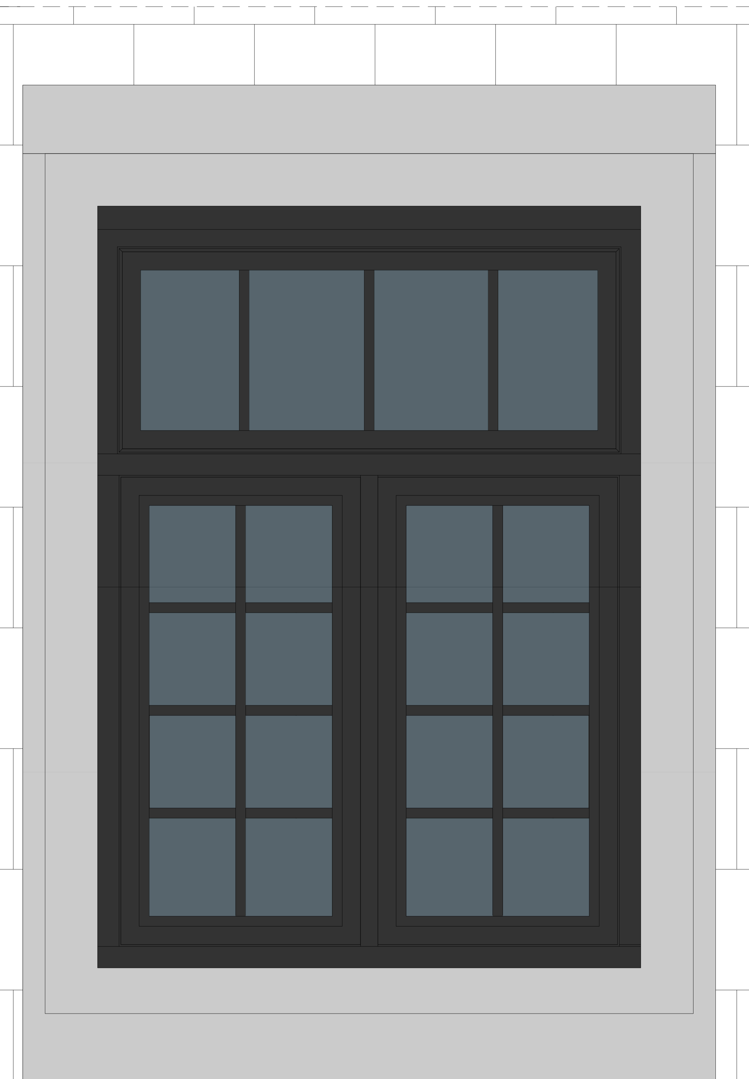
01 Elevation dW01 Window detail: Type A