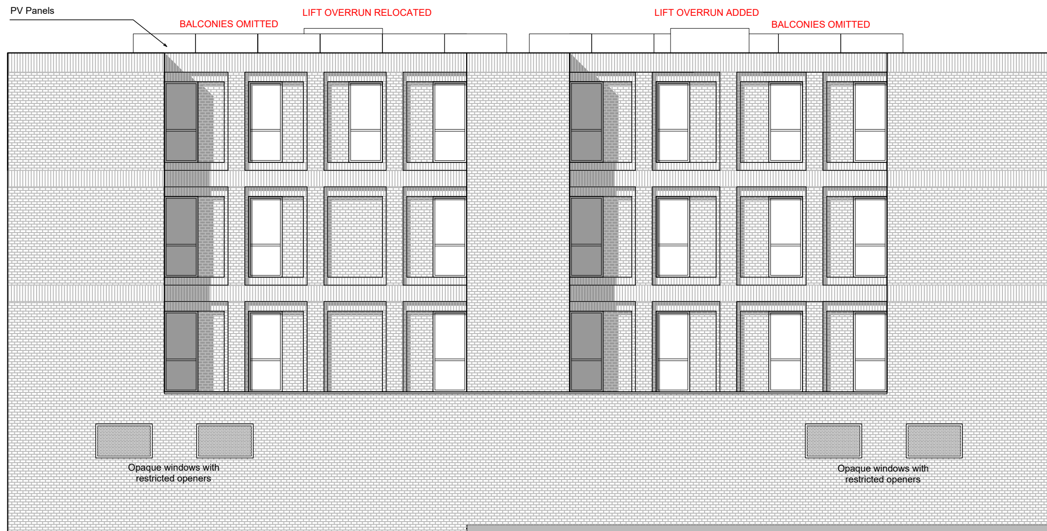
PROPOSED REAR ELEVATION (South) SCALE 1:100