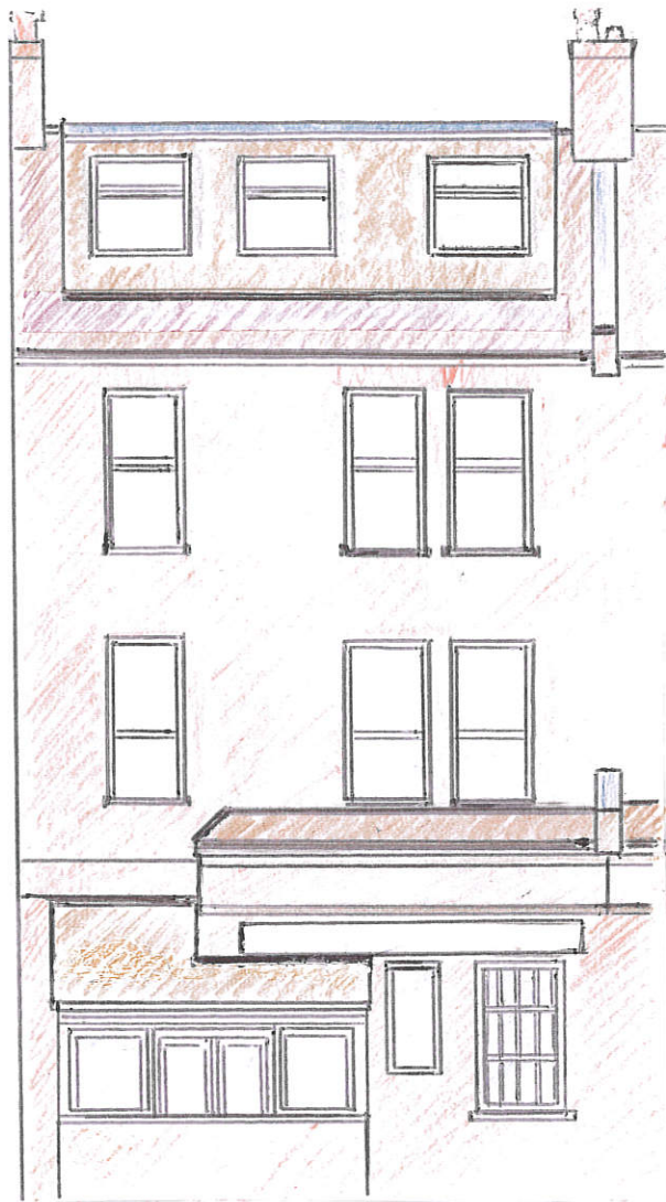
Existing Rear Elevation View

Flat 4 13 St Cuthbert's Road, London. NW2 3QJ.