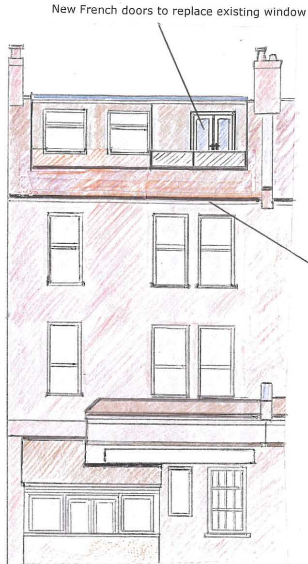
Proposed Rear Elevation View

Installation of French doors and small balcony detail