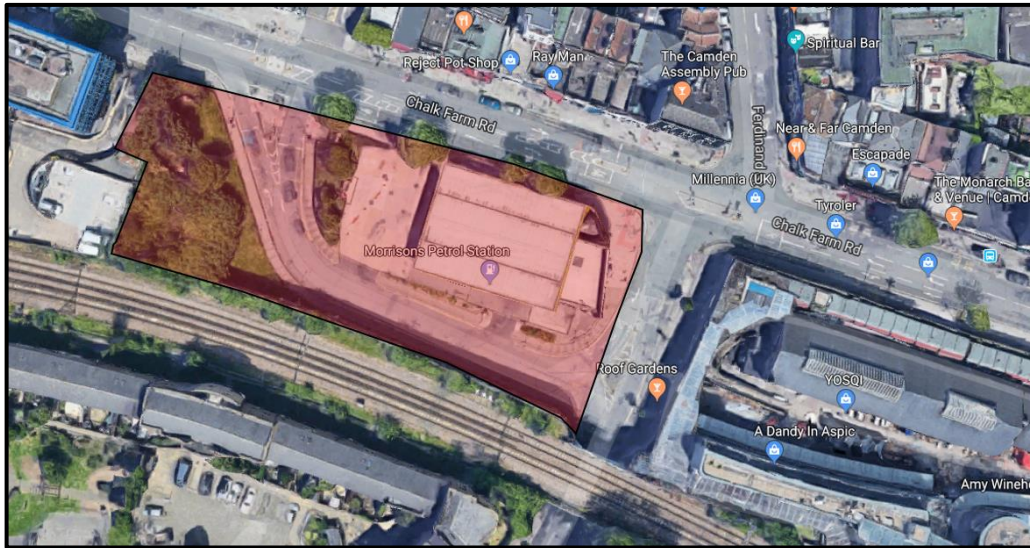
Plate 1: Site Location