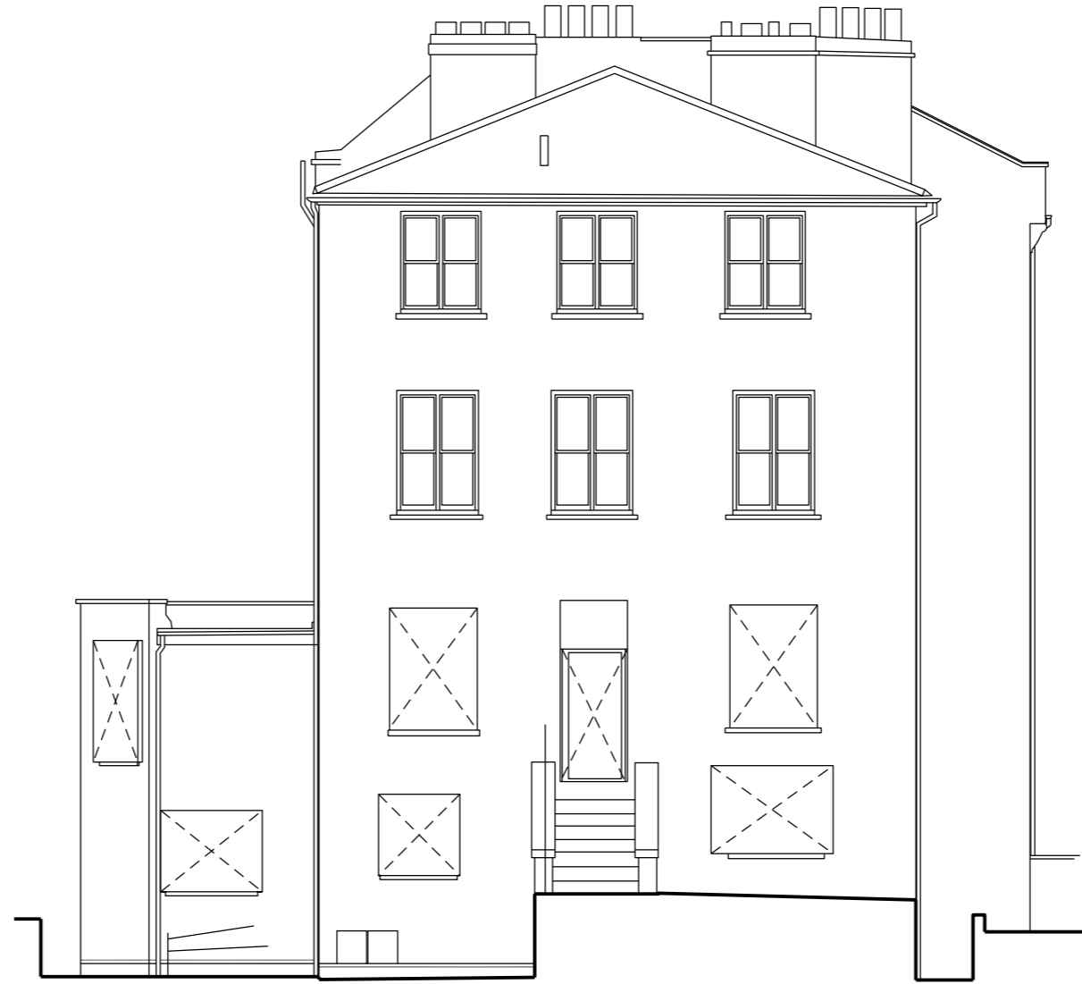
ELEVATION 2 (lower ground and ground floor windows and door shown with existing security hoarding)