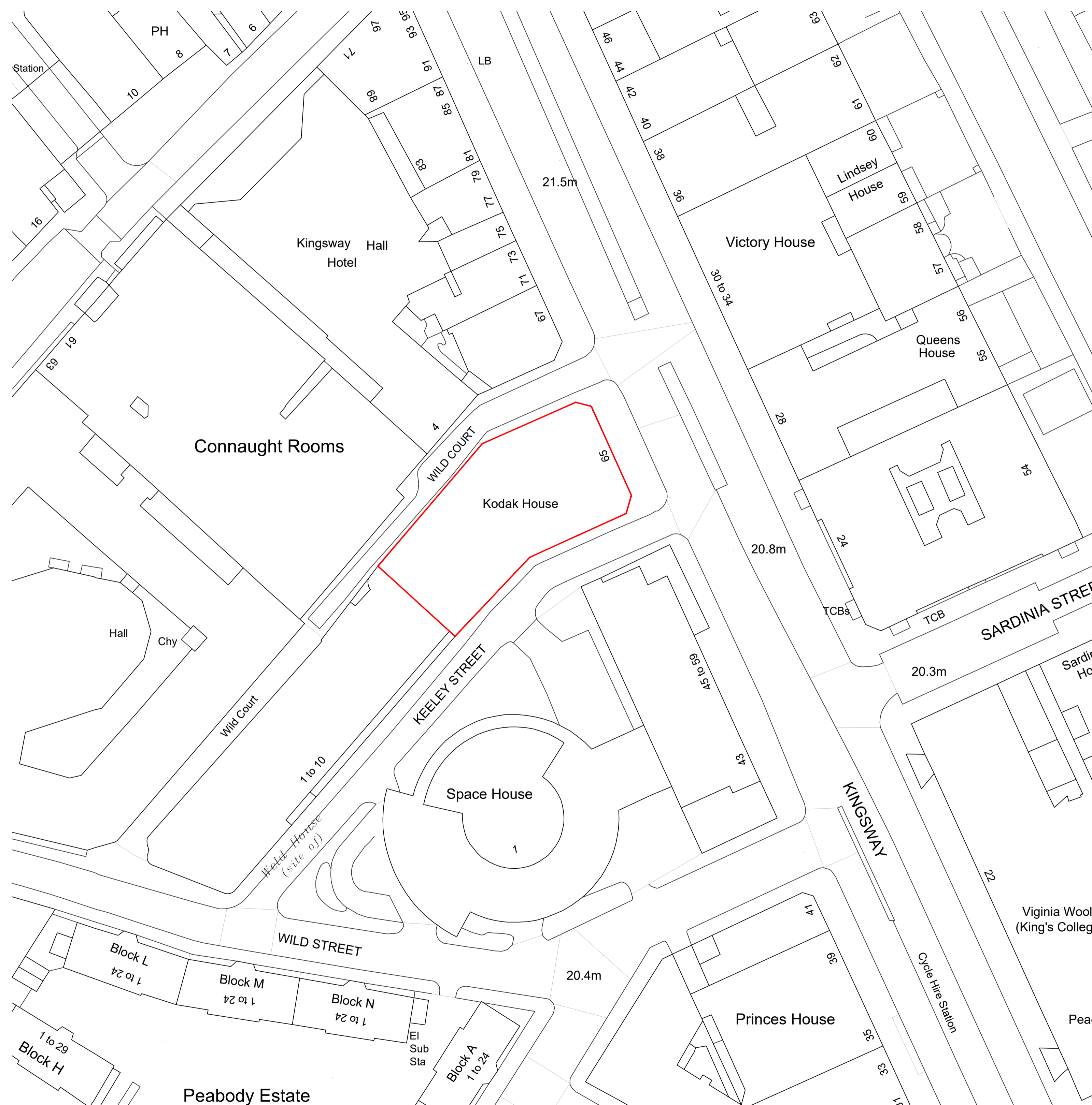
01 Existing Site Plan 10.101 1:500@A1