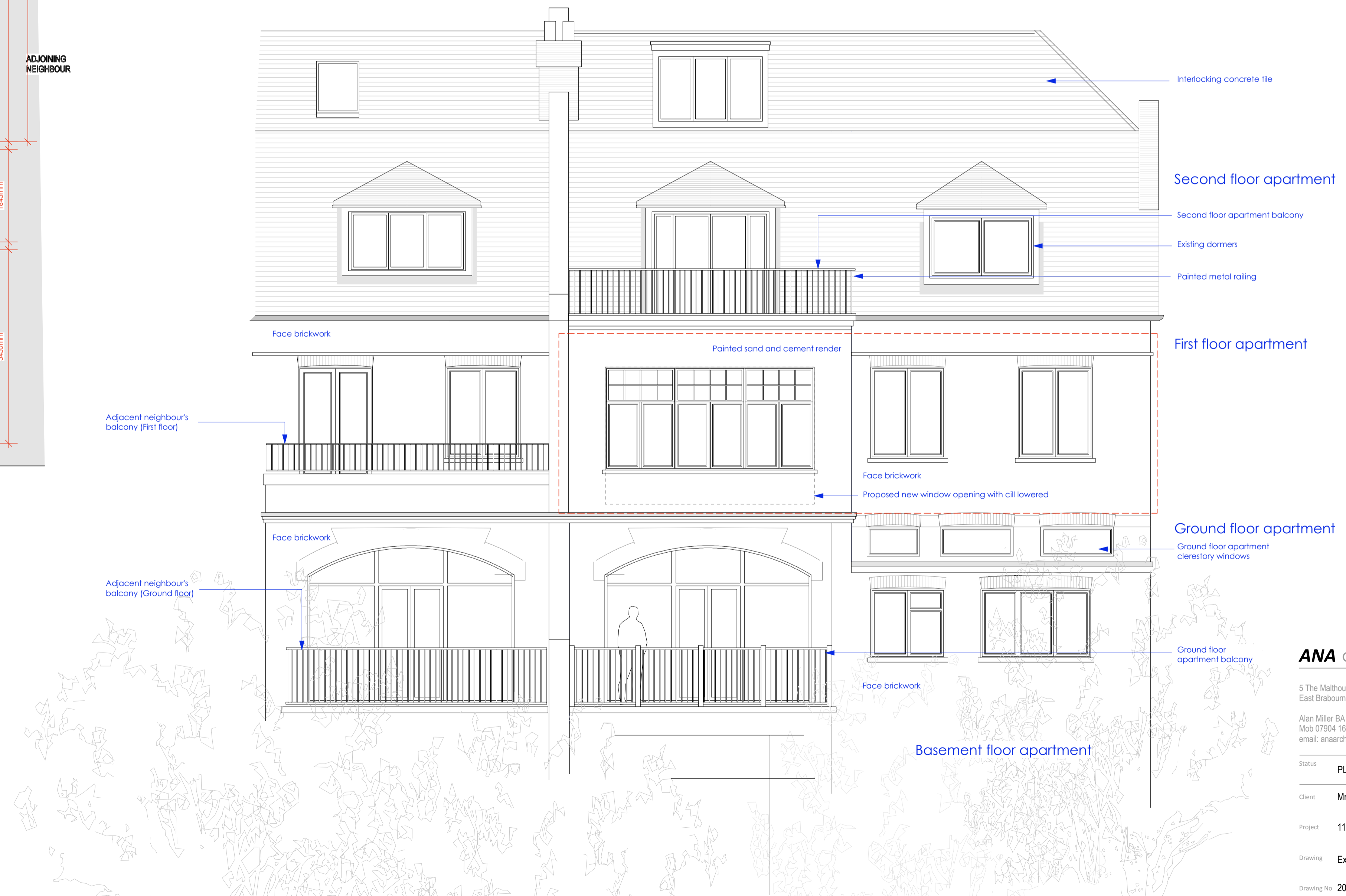
3 Existing Rear Elevation Scale 1:50@A1