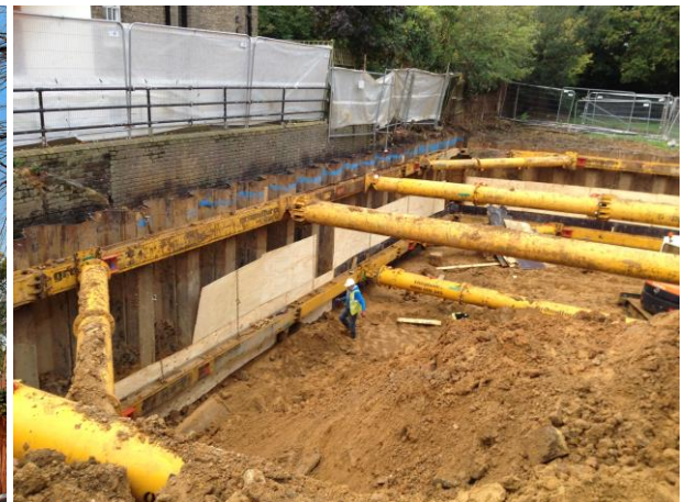
Basement during construction. Note sheet piling installed ahead of excavation and temporary propping installed as excavation proceeds.

CLAY STREET, LONDON - apartments incorporating single storey basement with party walls to three sides and fronting main Central London mews. Completed 2015.