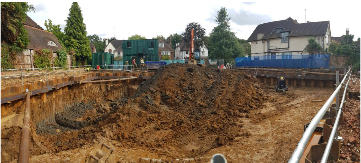
Current progress. Note metal sheet piling support installed ahead of excavation and temporary propping being installed as excavation progresses.