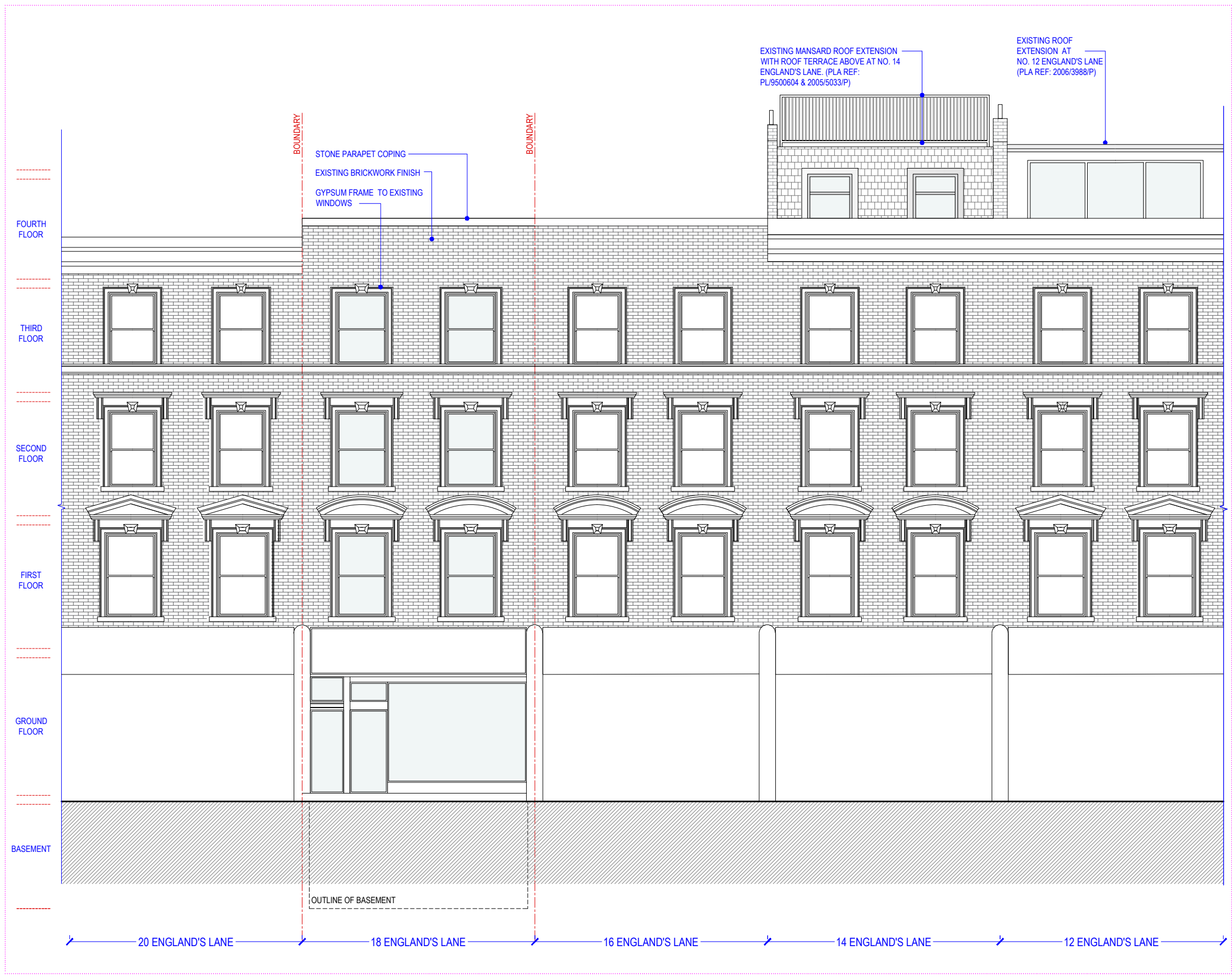
[01] EXISTING FRONT ELEVATION