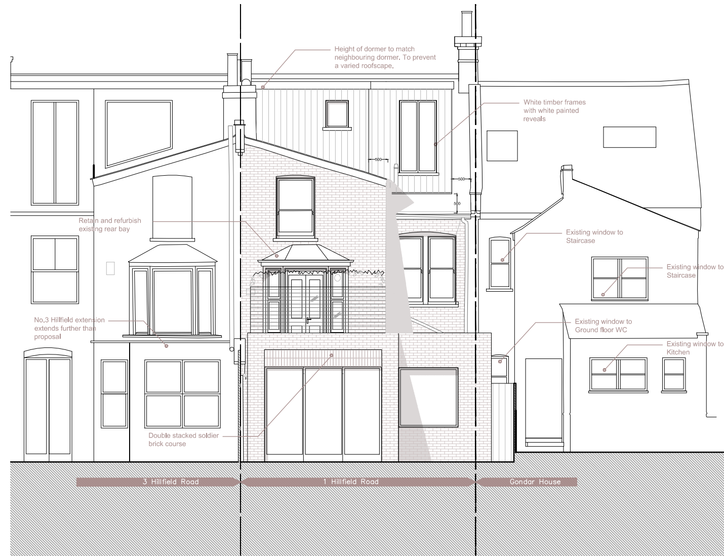
Proposed Rear Elevation - 1:100@A3