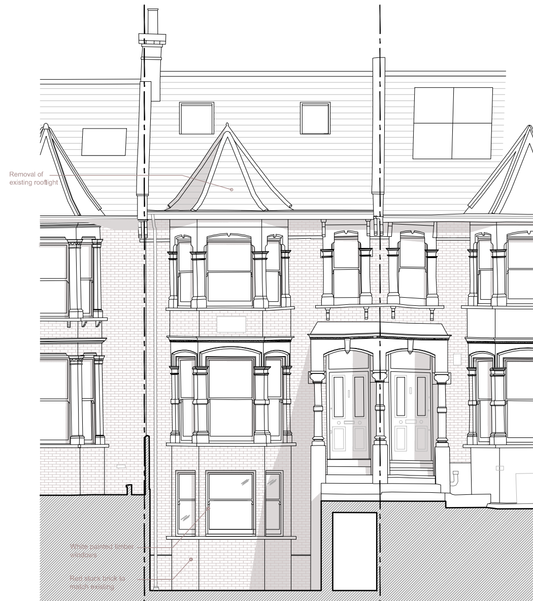
Proposed Front Elevation - 1:100@A3

All plans, sections & elevations are based on measured readings and any scaled dimension should not be relied upon to give an accurate measurement.