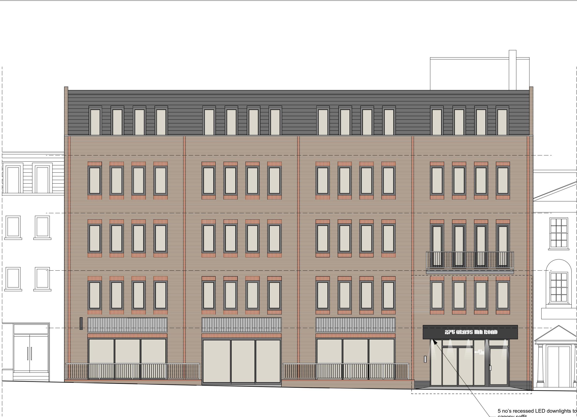
1 PROPOSED EAST (FRONT) ELEVATION Scale: 1:50 @ A1/1:100 @ A3