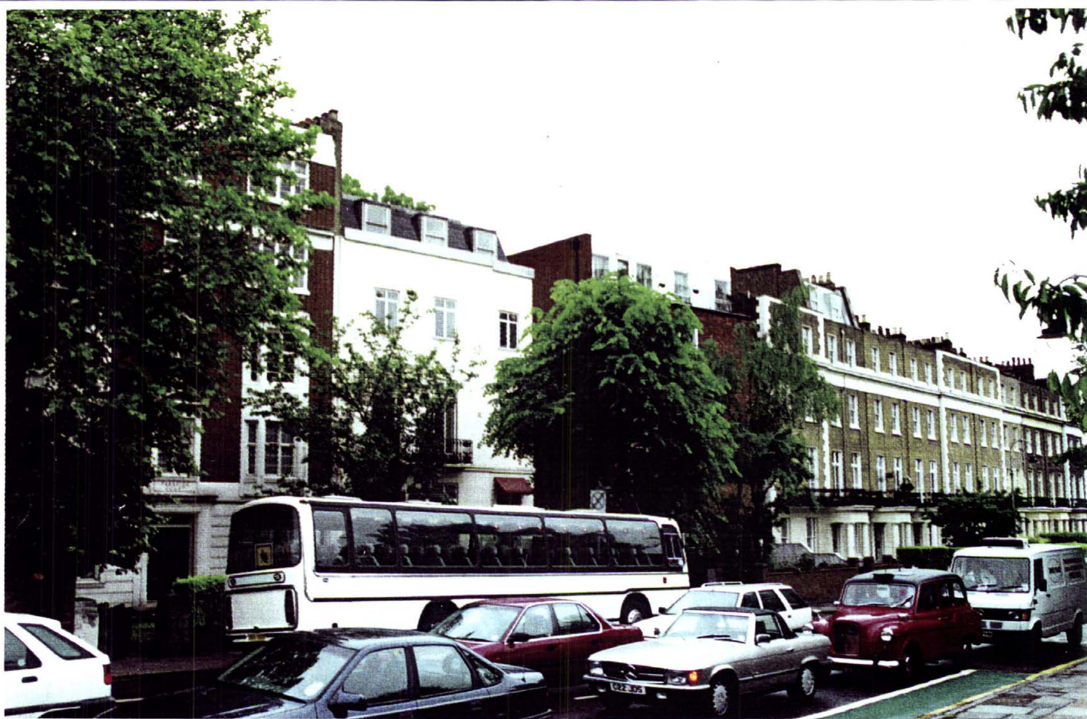
View of Existing Mansard Roof extensions on Gloucester Avenue opposite Block E