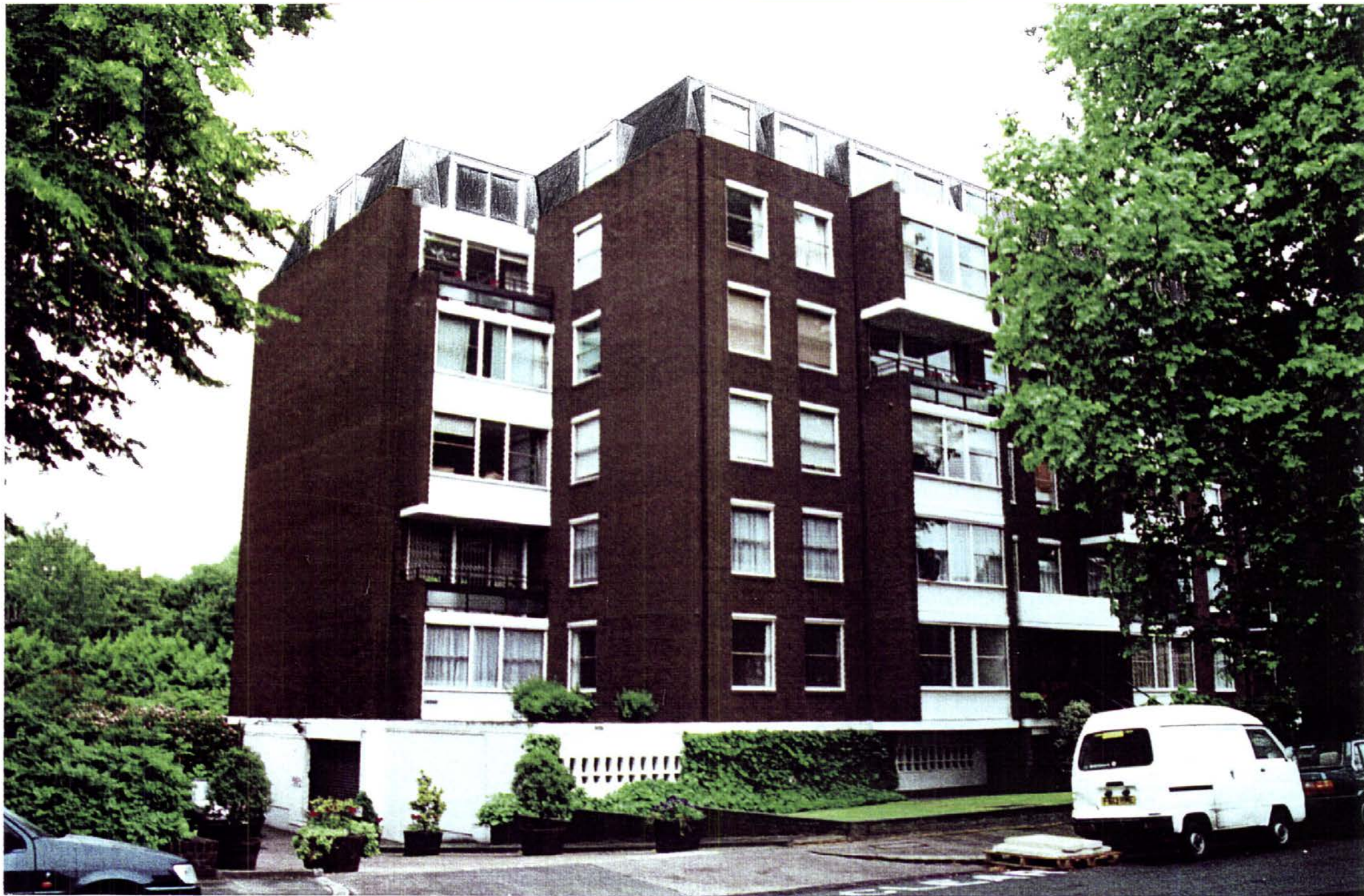
View of Block C from the West with roof extension superimposed