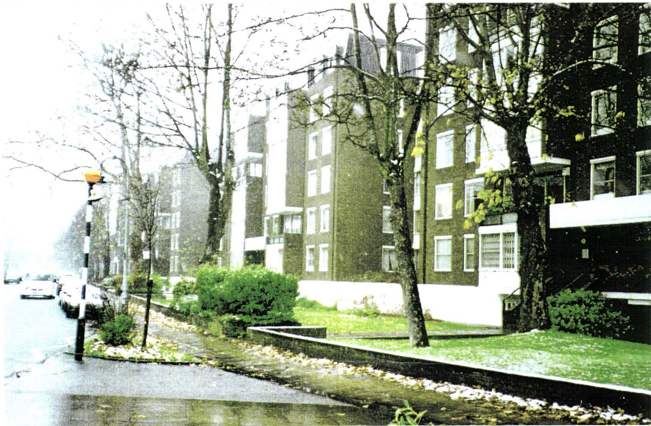
Winter View of Blocks B and C from the South with roof extension superimposed