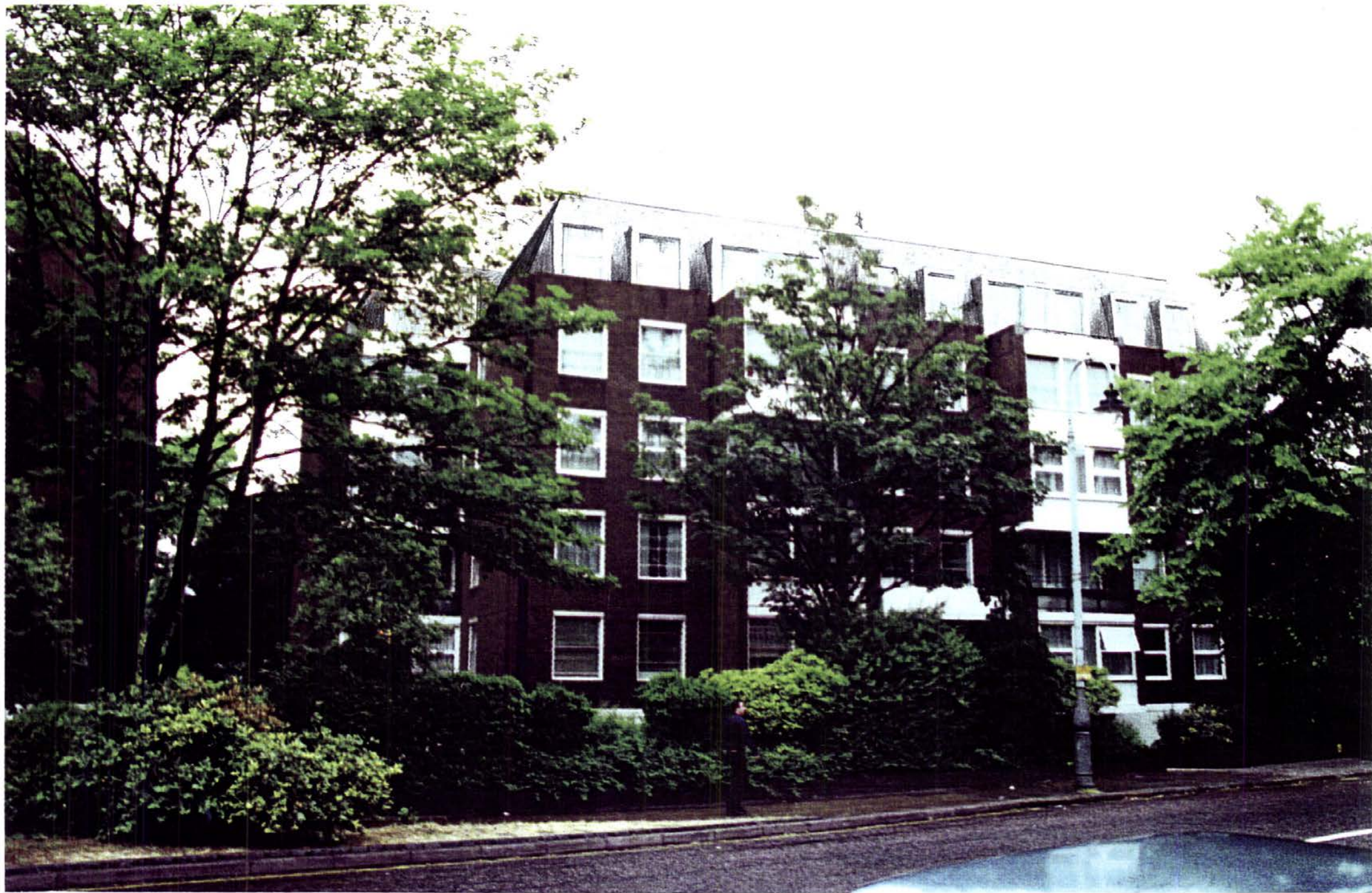
View of Block E from the West with roof extension superimposed