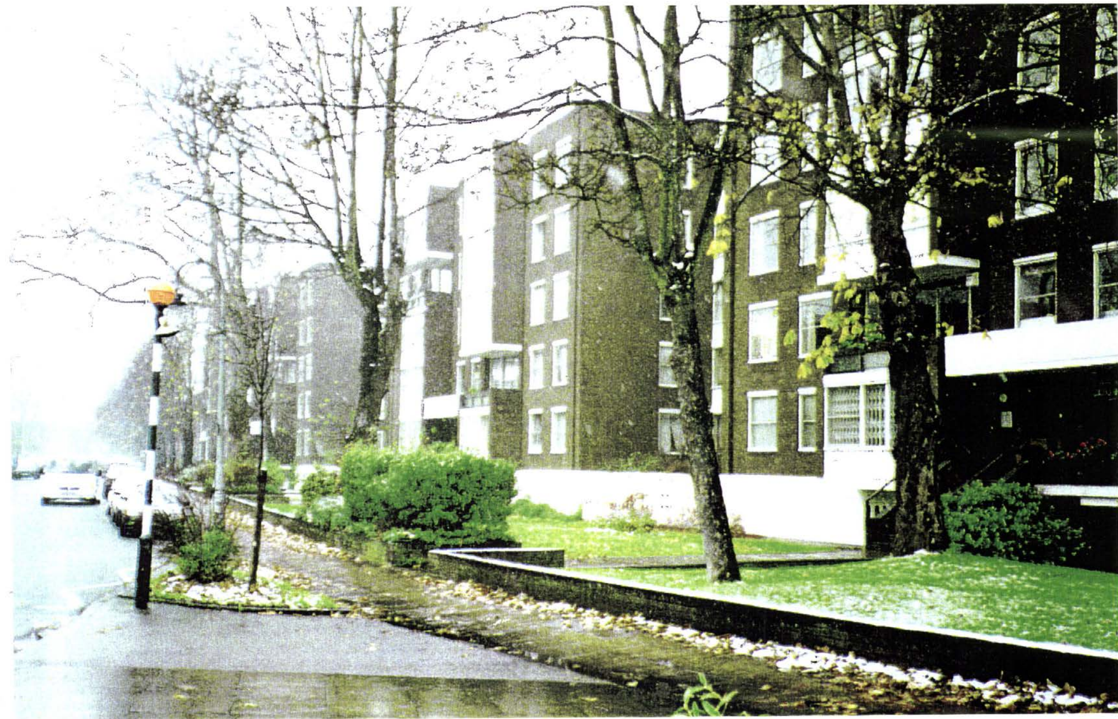
Existing Winter View of Blocks B and C from the South