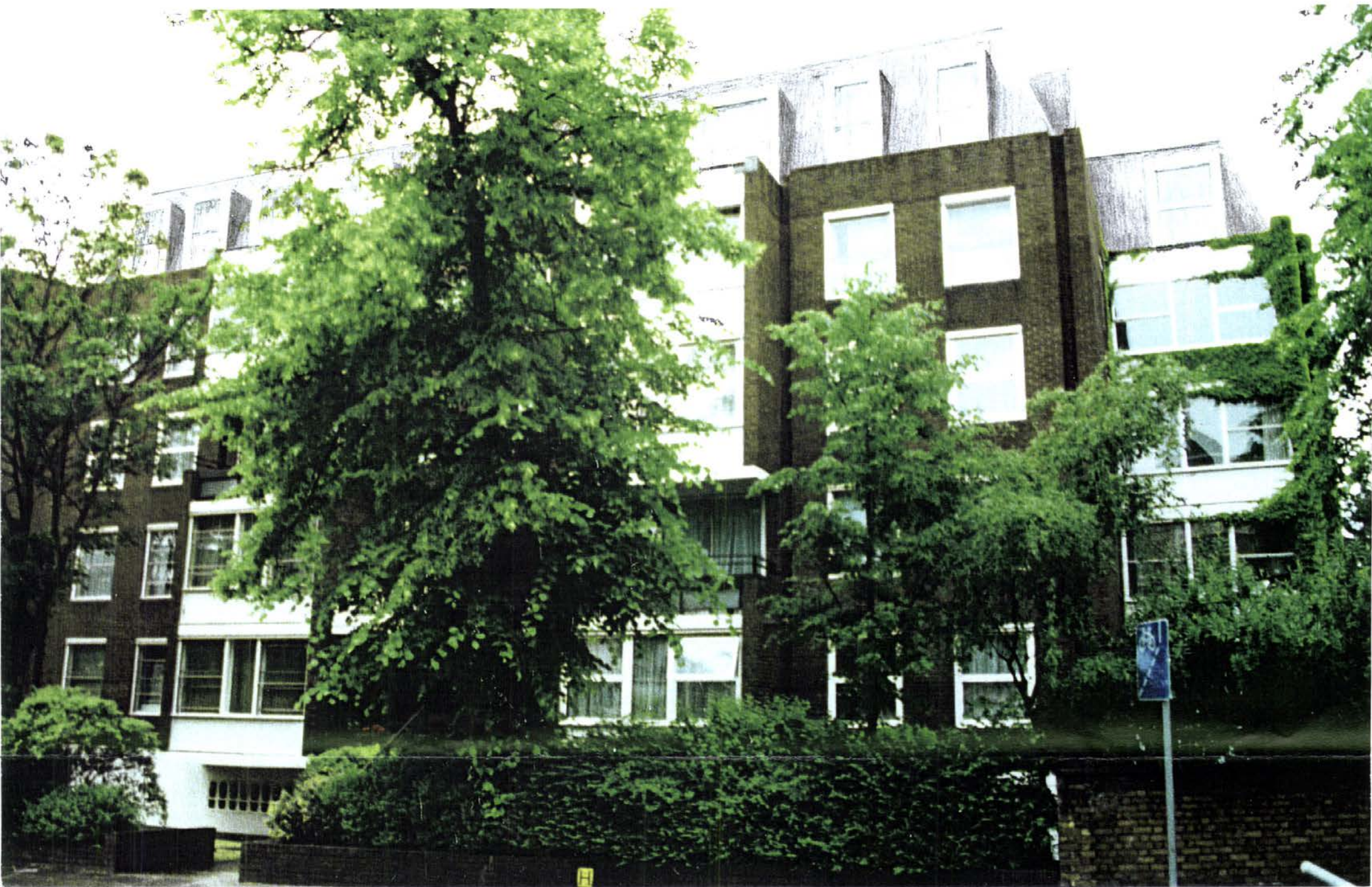
View of Block E from the South with roof extension superimposed