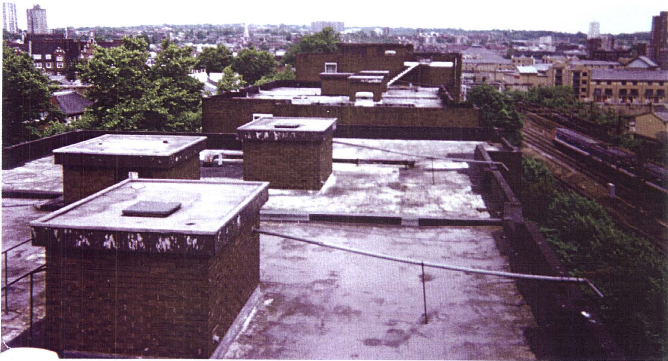
View of existing flat roofs to Blocks B and C