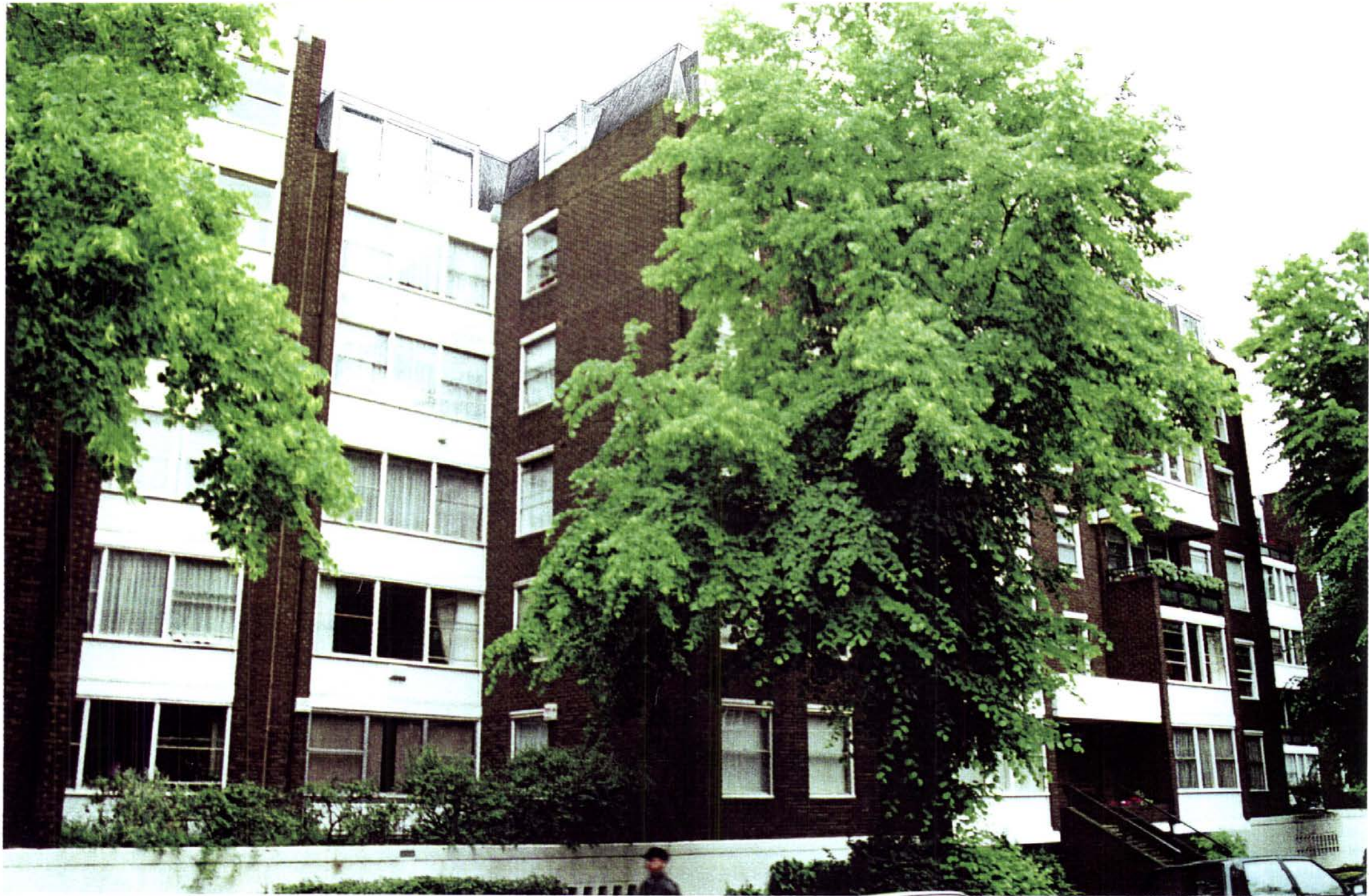
View of Block B from the West with roof extension superimposed