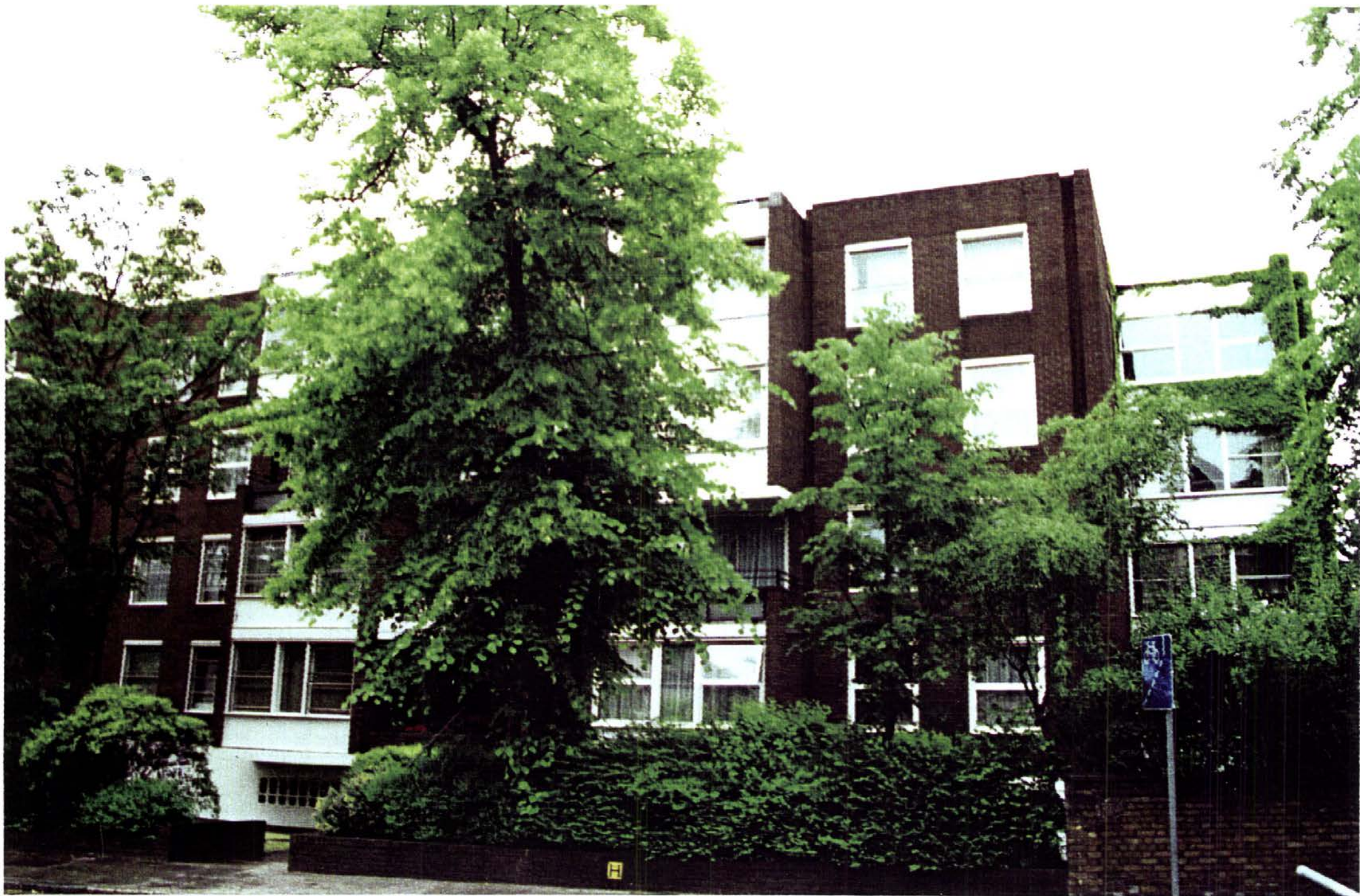
Existing view of Block E from the South