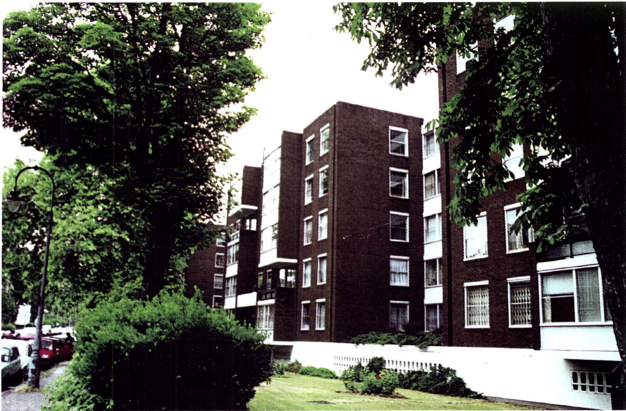
Existing view of Block C from the South