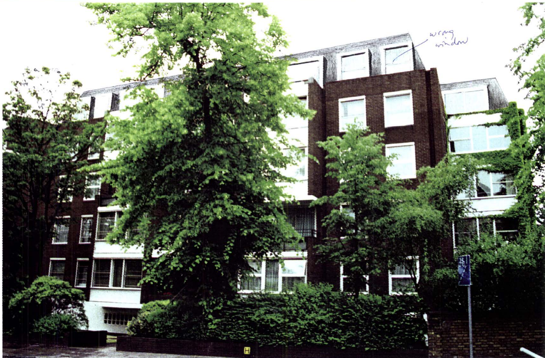
View of Block E from the South with roof extension superimposed