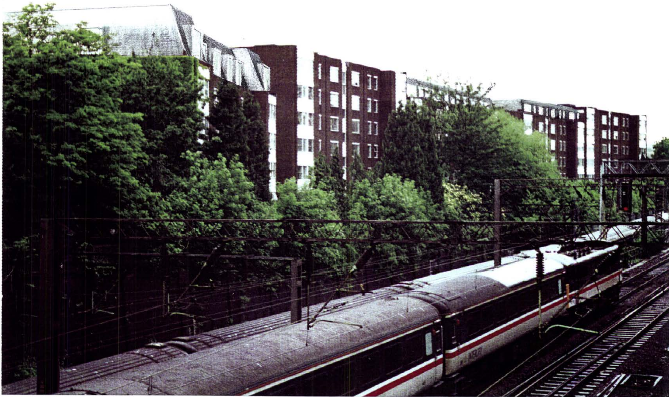
View of the Development from the South East with roof extension superimposed