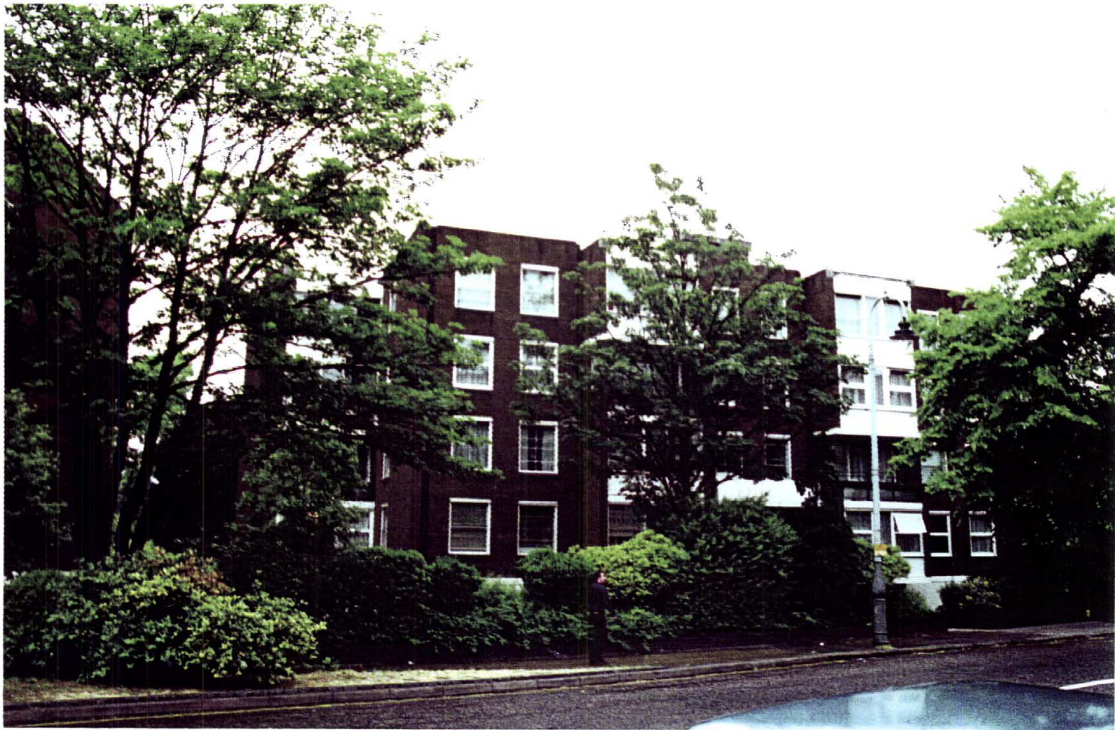
Existing view of Block E from the West