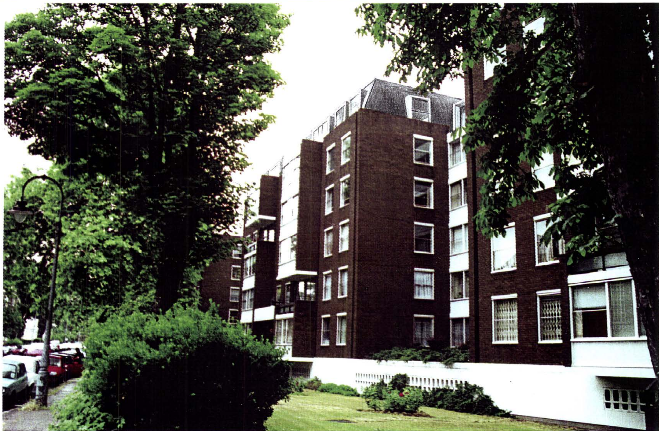
View of Block C from the South with roof extension superimposed