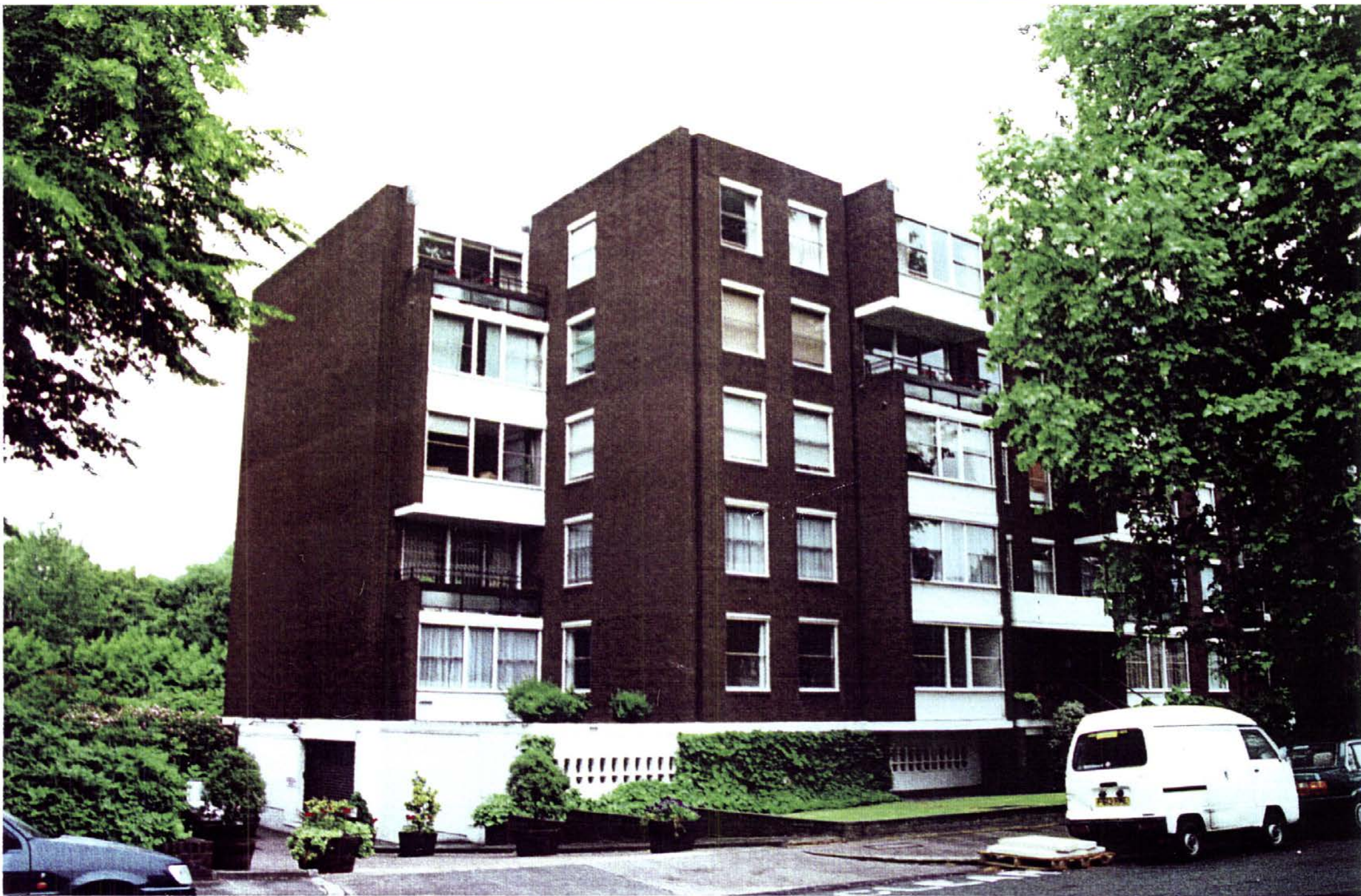
Existing view of Block C from the West