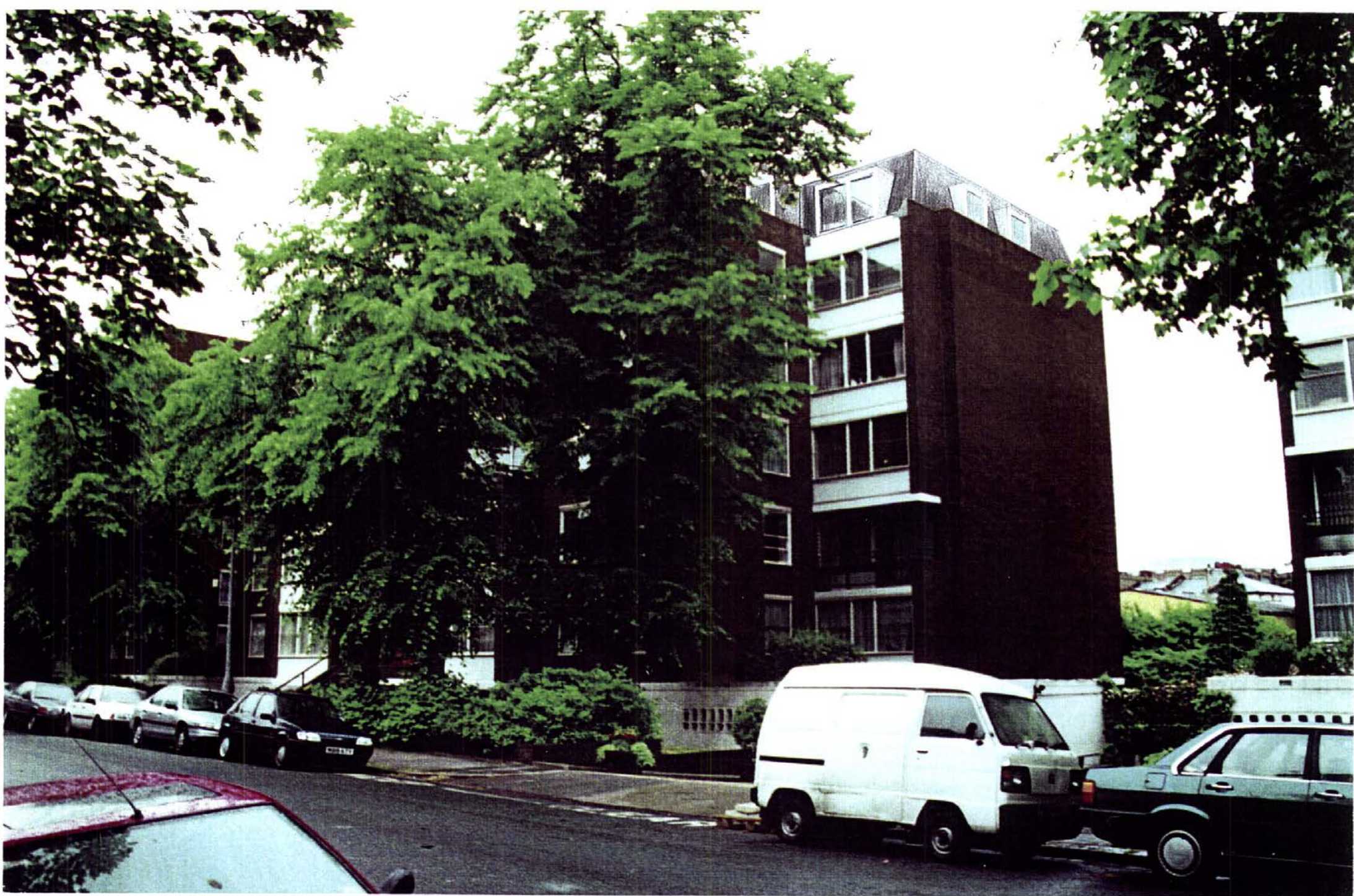
View of Block B from the South with roof extension superimposed