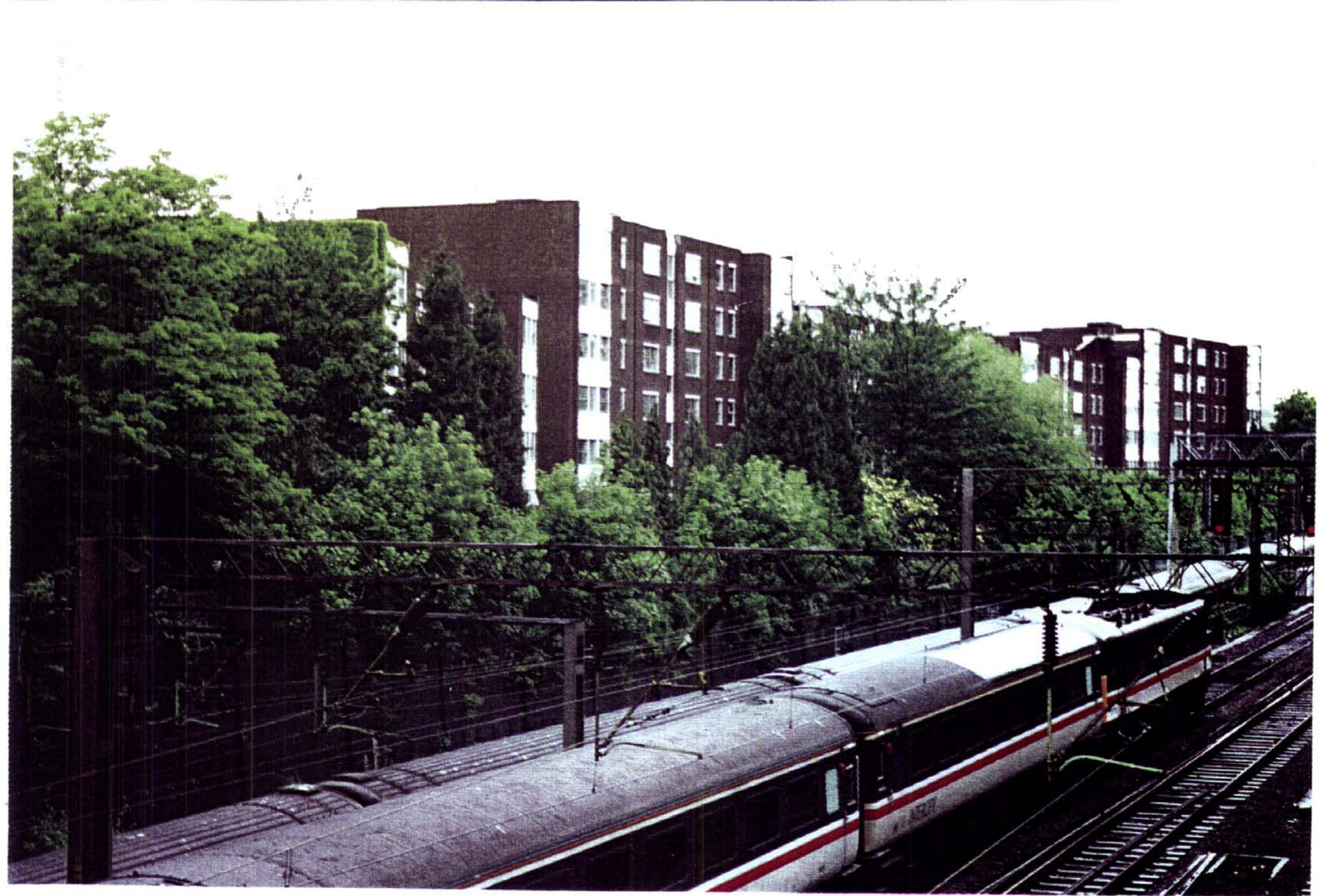
Existing view of Development from the South East