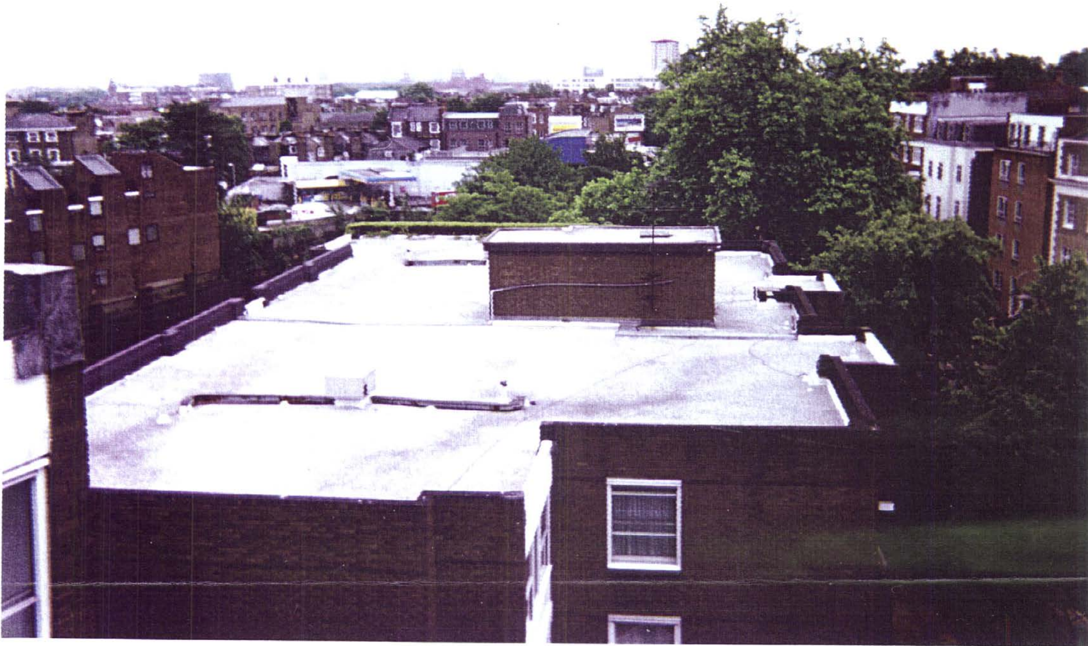
View of existing flat roof to Block E