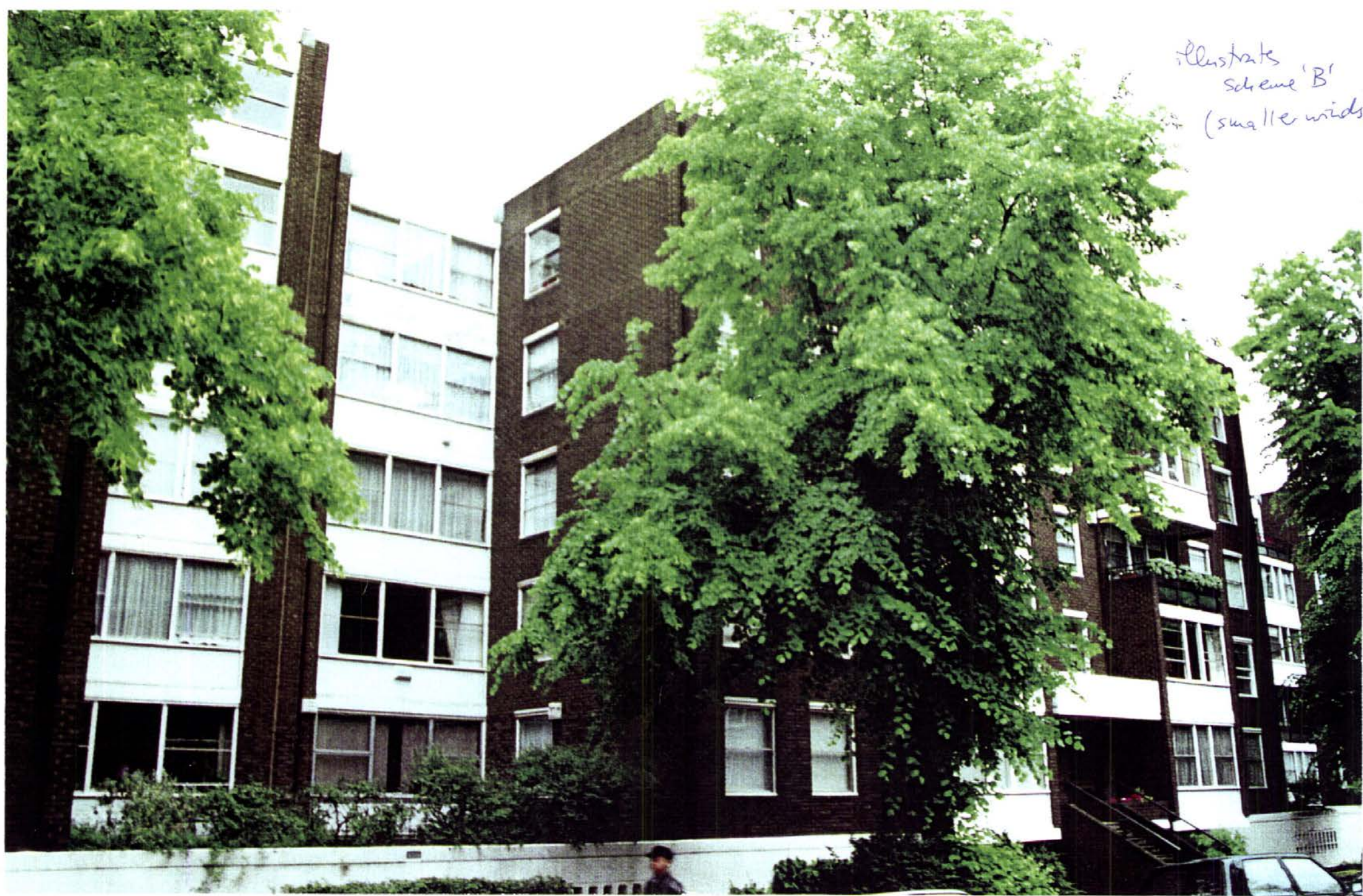
Existing view of Block B from the West