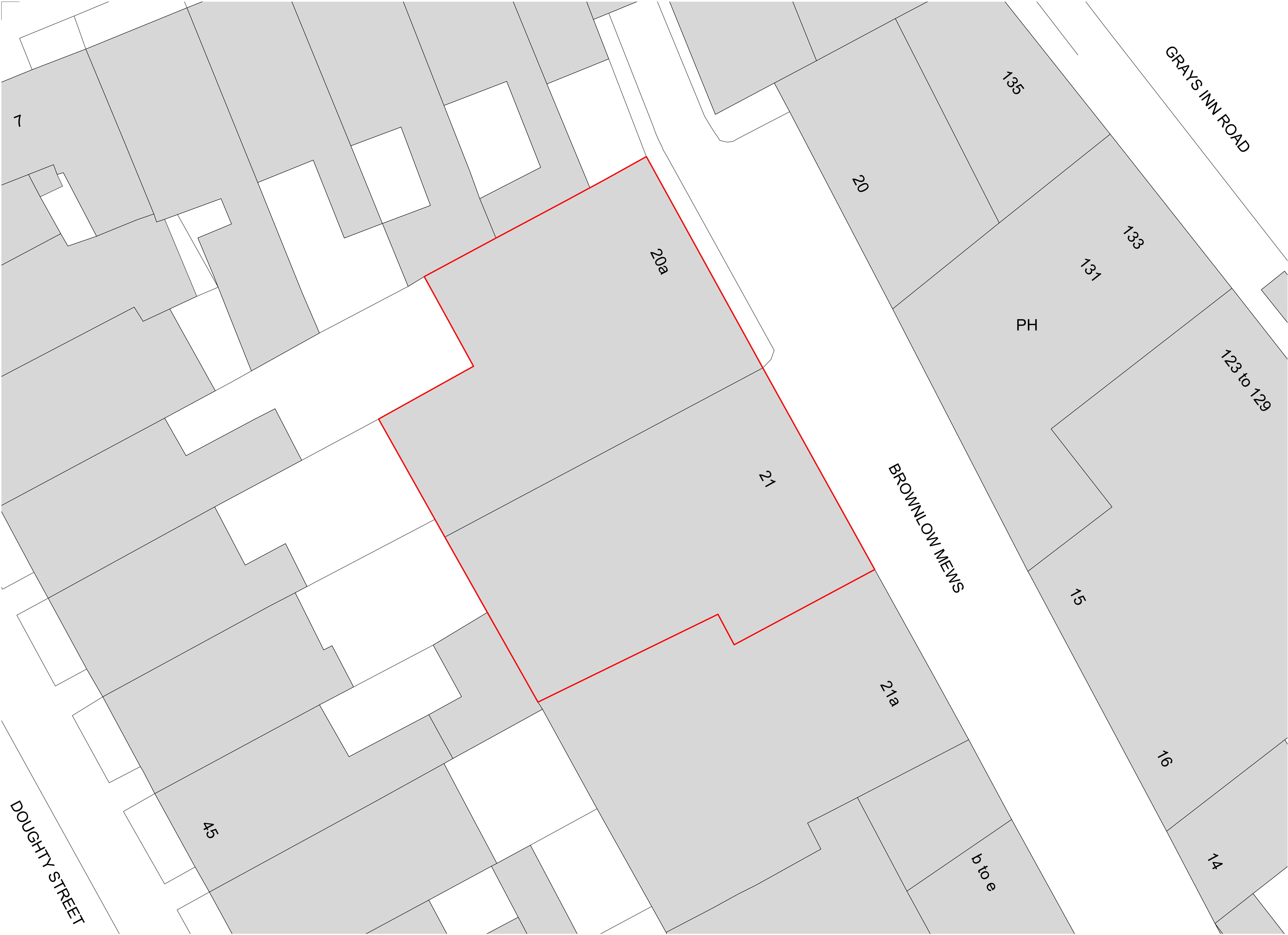
3 SITE LOCATION PLAN SCALE 1:200 @ A3