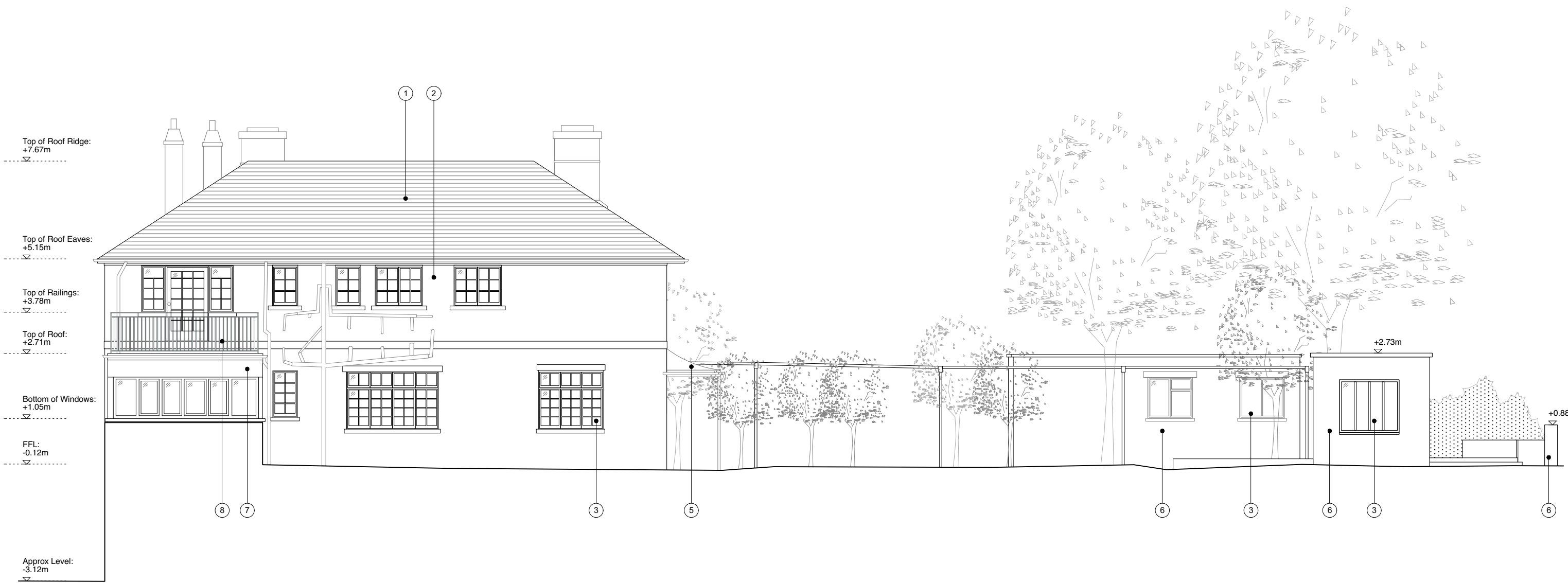
EXISTING ELEVATION B 1:100 @ A3