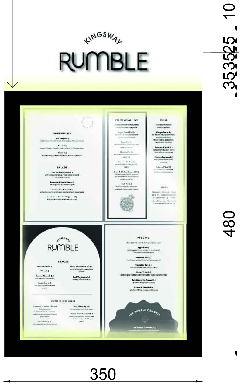
dD05 | Assembly detail: Proposed Kingsway Entrance 03 | Reference picture

Self illuminated menu board Aluminum frame: powder-coated black Case: 3mm clear acrylic glazing Text colour: black Background: white Illuminance levels: 300 cd/m2