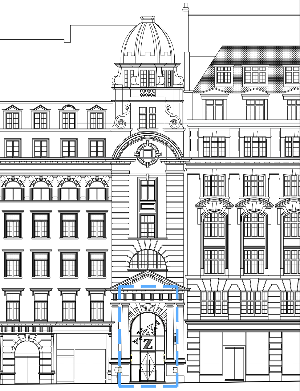
dD05 | Assembly detail: Kingsway Entrance 04 | Main front elevation

Do not scale from drawings. To be read in conjunction with all relevant Architects', Services and Structural Engineers' drawings. All dimensions to be checked on site. Errors to be reported immediately to the Architect.