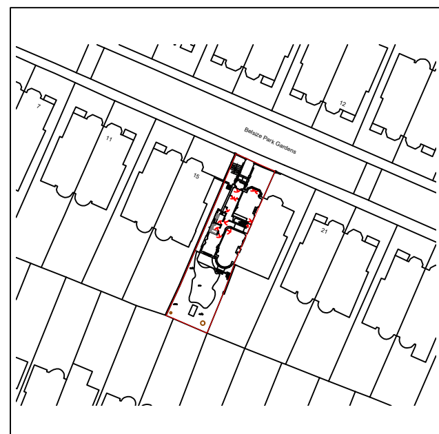
Location plan 1:1250

NOTES ALL DIMENSIONS PROVIDED ON DRAWING TO BE CHECKED PRIOR TO COMMENCING ON SITE. ANY DISCREPANCY CONTAINED WITHIN THIS DRAWING IS TO BE REPORTED TO THE SURVEYOR.