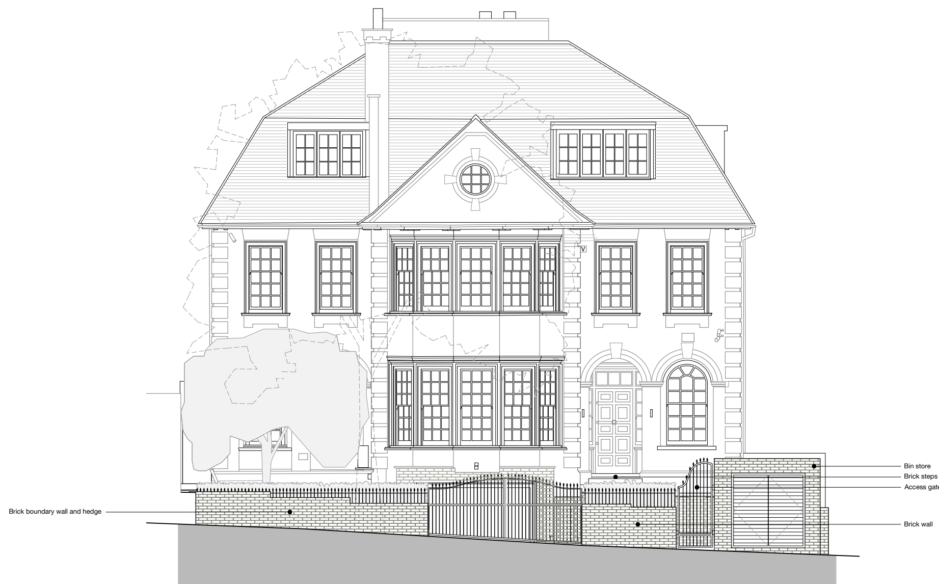
103.01 EXISTING ELEVATION 1 1:100 @ A3