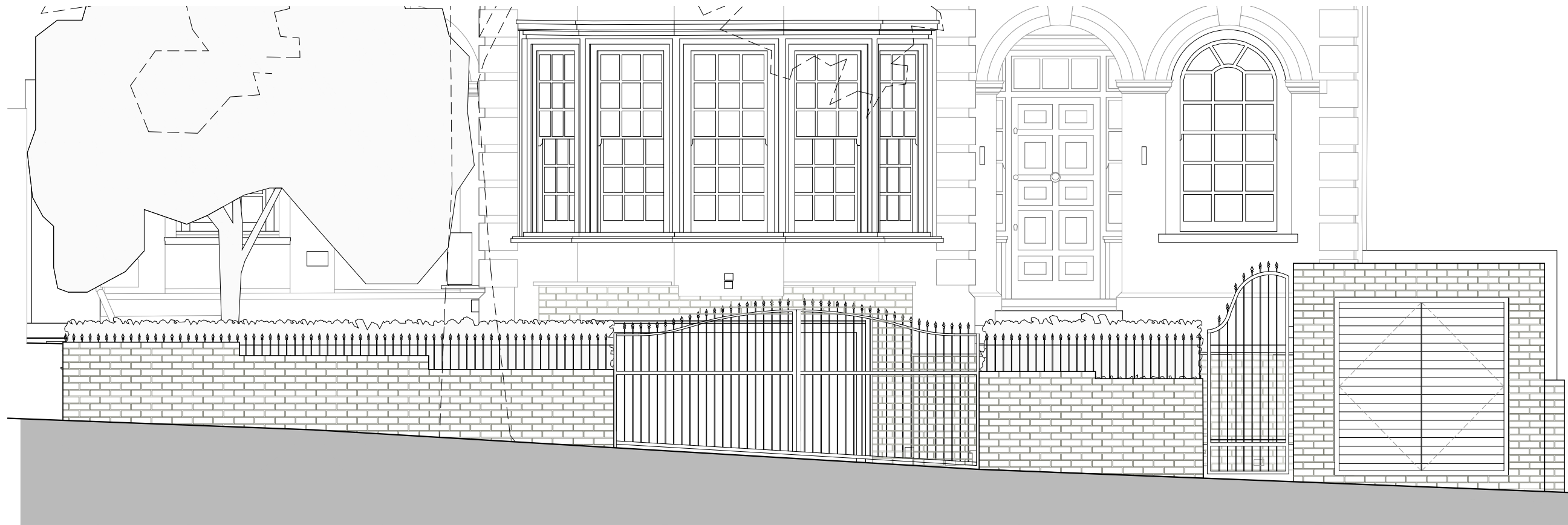
101.01 EXISTING ELEVATION 1 1:50 @ A3