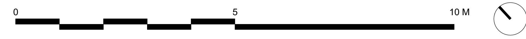
1 Proposed 3F Demolition Plan Scale: 1:50-A1 / 1:100-A3

Do not scale from drawing, all dimensions to be checked on site. Report omissions and discrepancies to the architect immediately