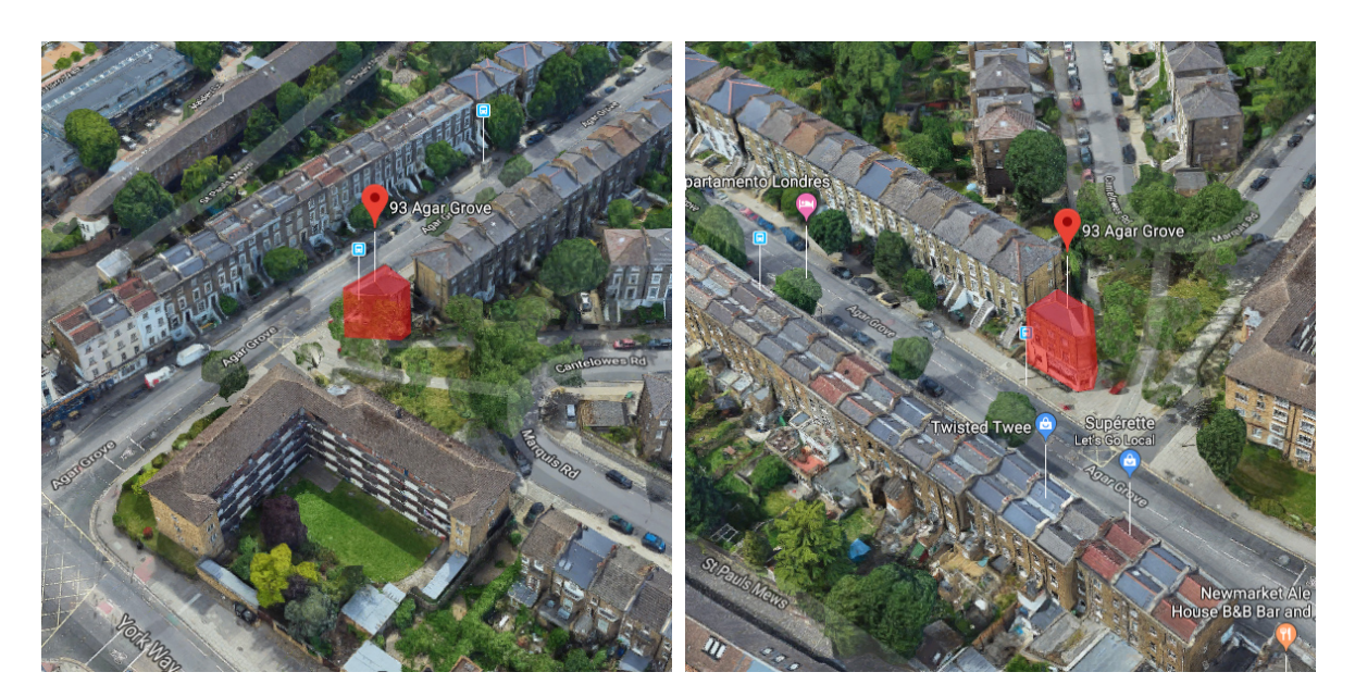
Bird's eye view of the site (93 Agar Grove)