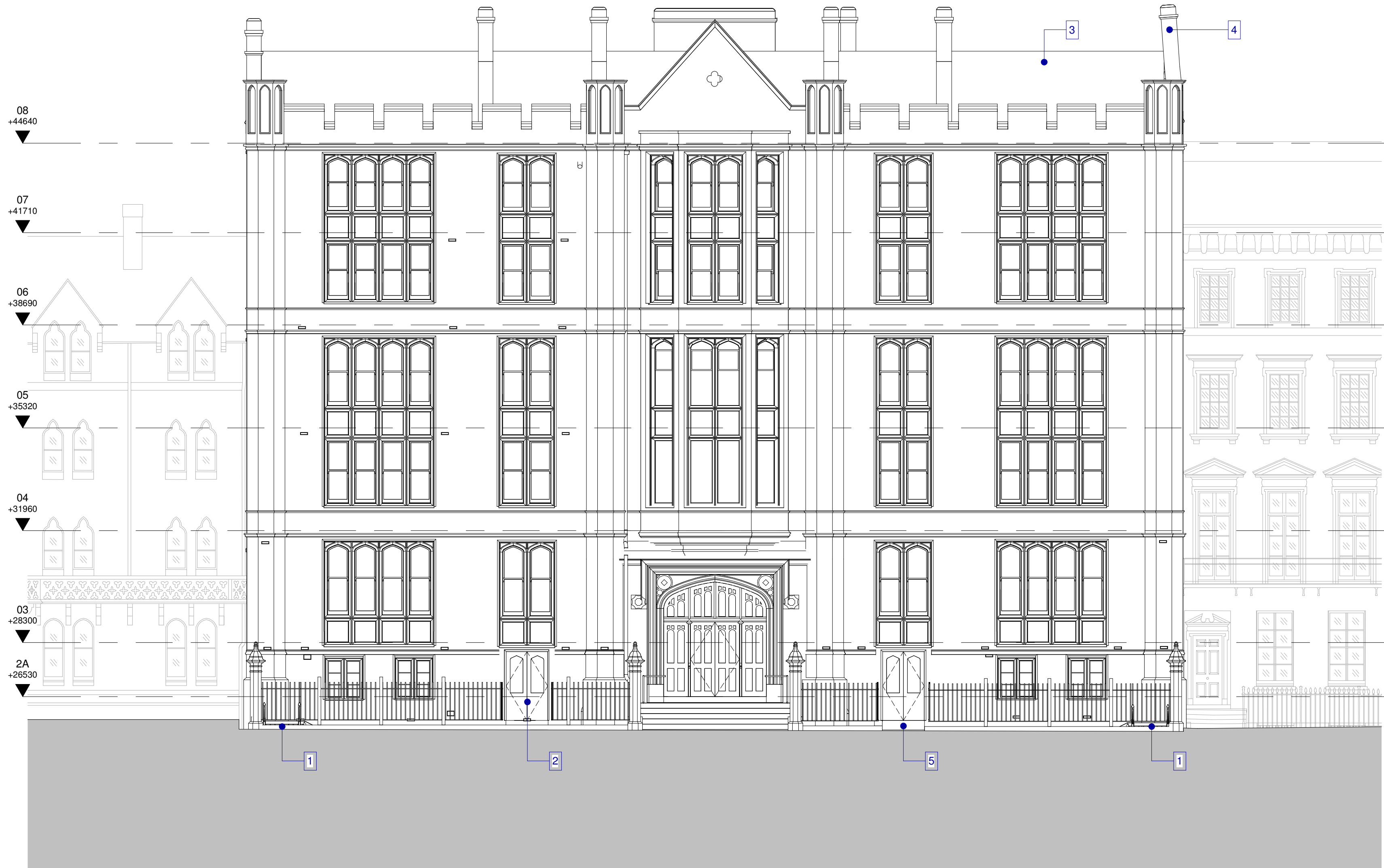
Proposed GA Elevation - Front 1 : 100

1 New metal stairs to replace existing unstable stone stairs to Level 1.