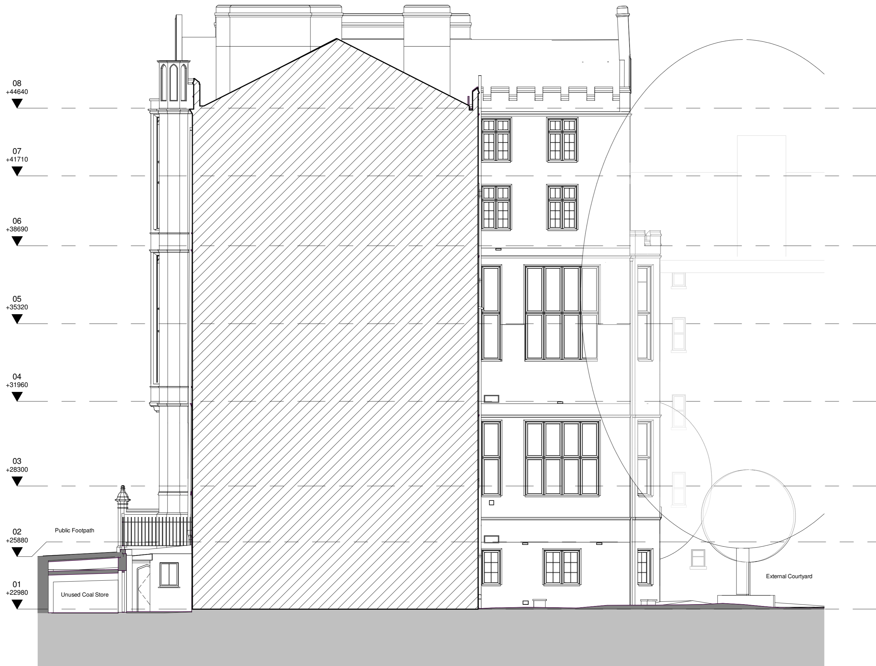
Existing GA Elevation - Central Wing B 1 : 100