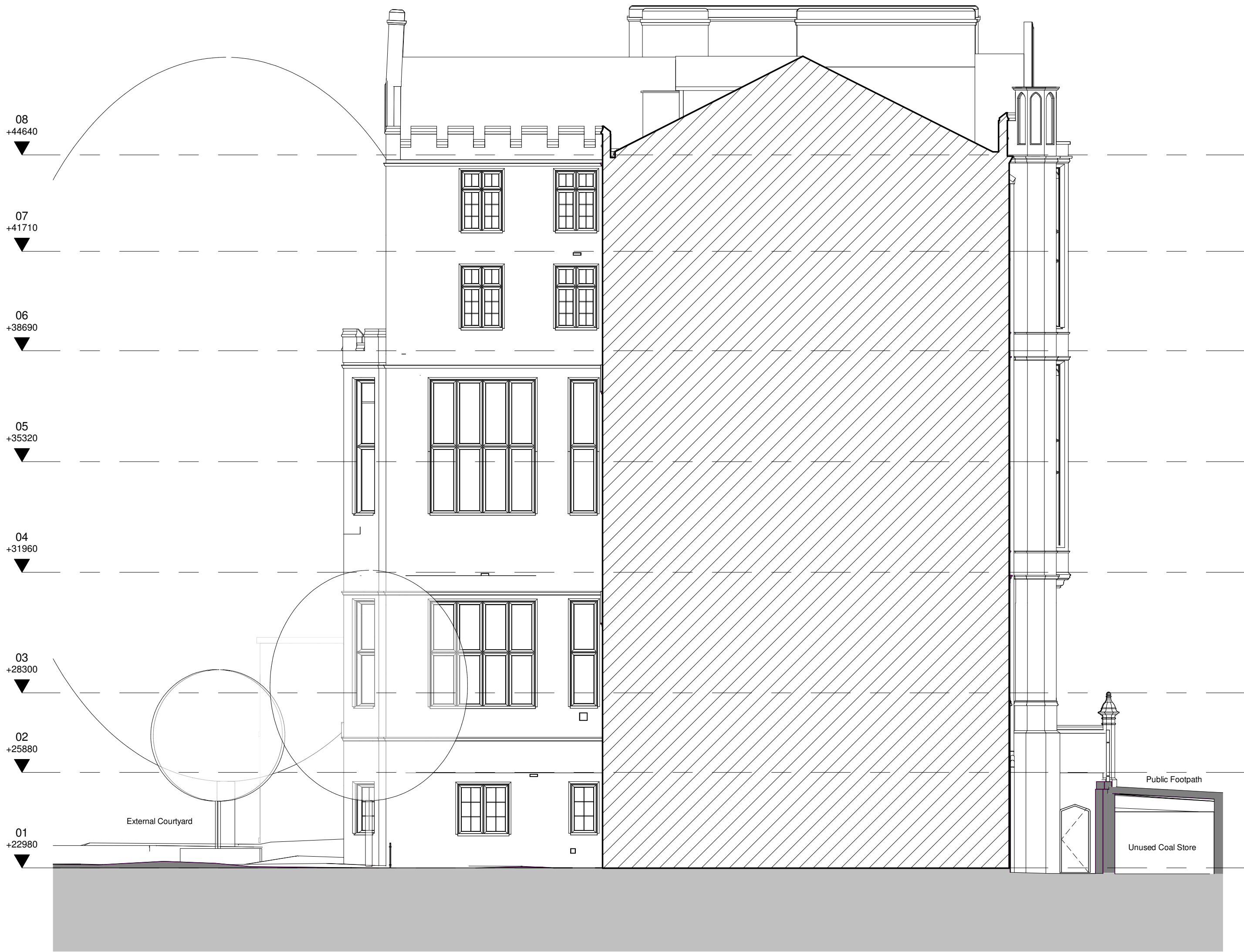
Existing GA Elevation - Central Wing A 1 : 100

Drawing based on survey information, Revit model and CAD drawings produced by City Survey's and Survey Hub, refer to below files. CPMG cannot be held responsible for any discrepancies within the original Revit survey or CAD drawings. - 10410E_R (City Surveys) - CSDr 000765-DWL-SU-DRG-0001-A01.rvt (City Surveys) - 3916_Dr Williams Library_3D Model (Survey Hub)