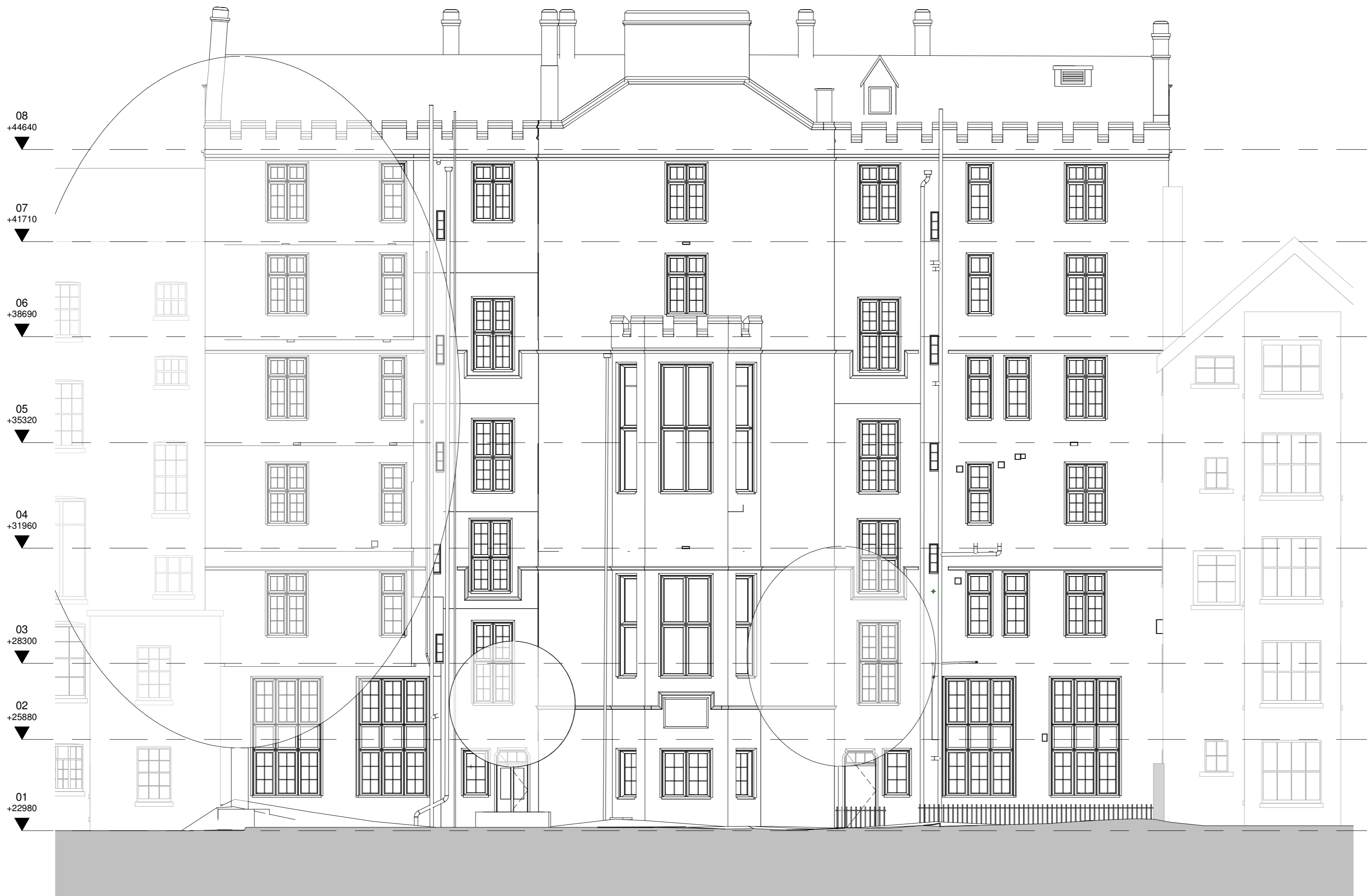
20-E-Rear_Existing 1 : 100