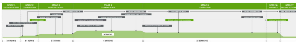
Figure 2: Project Life and Contractual Milestones