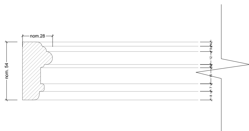
04 EXISTING DADO RAIL - D-01 1:2@A3,1:1@A1