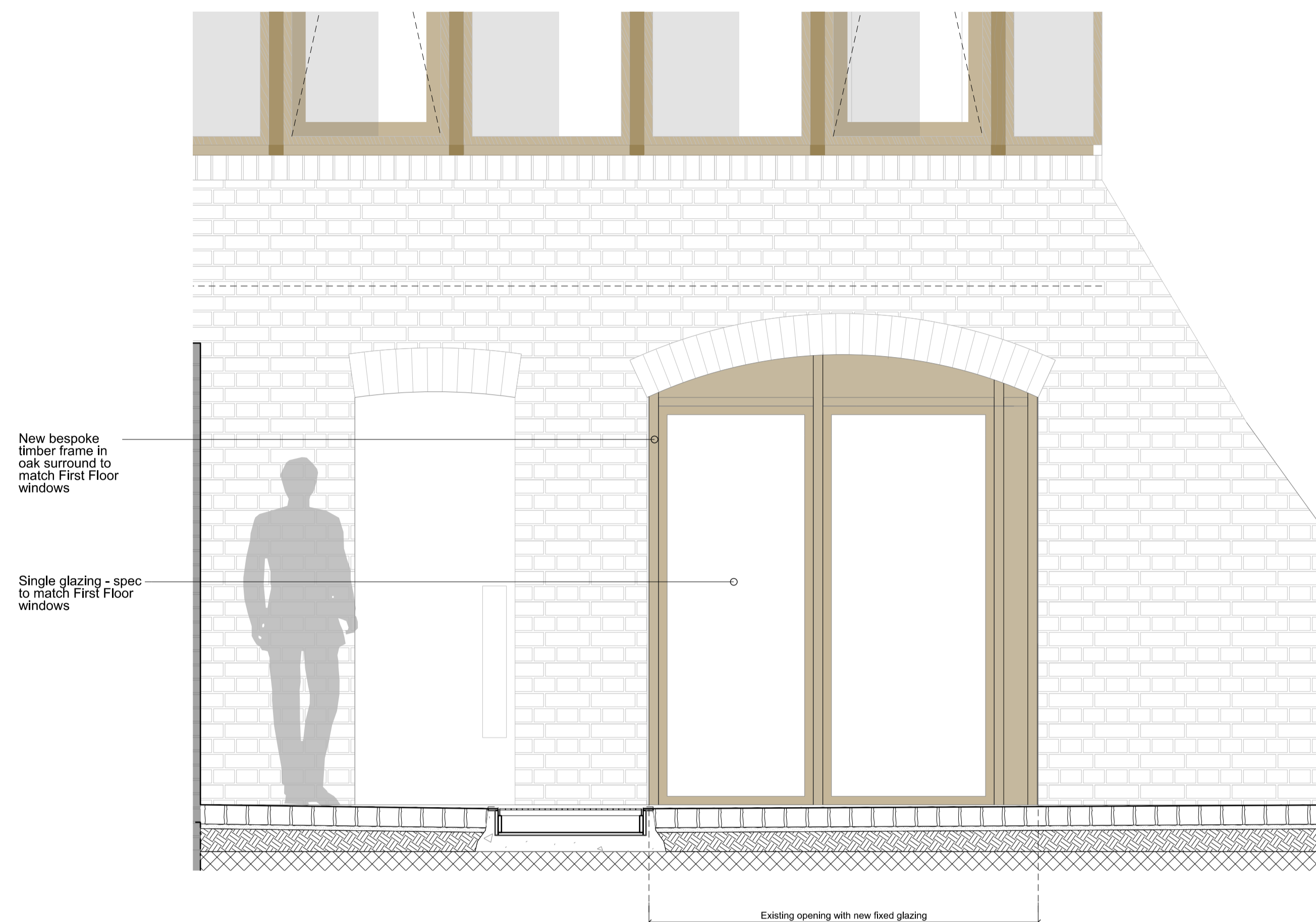
01 Proposed Elevation detail showing Ground Floor window 7D(PL)28 7 Denmark Street - Mews 1:20