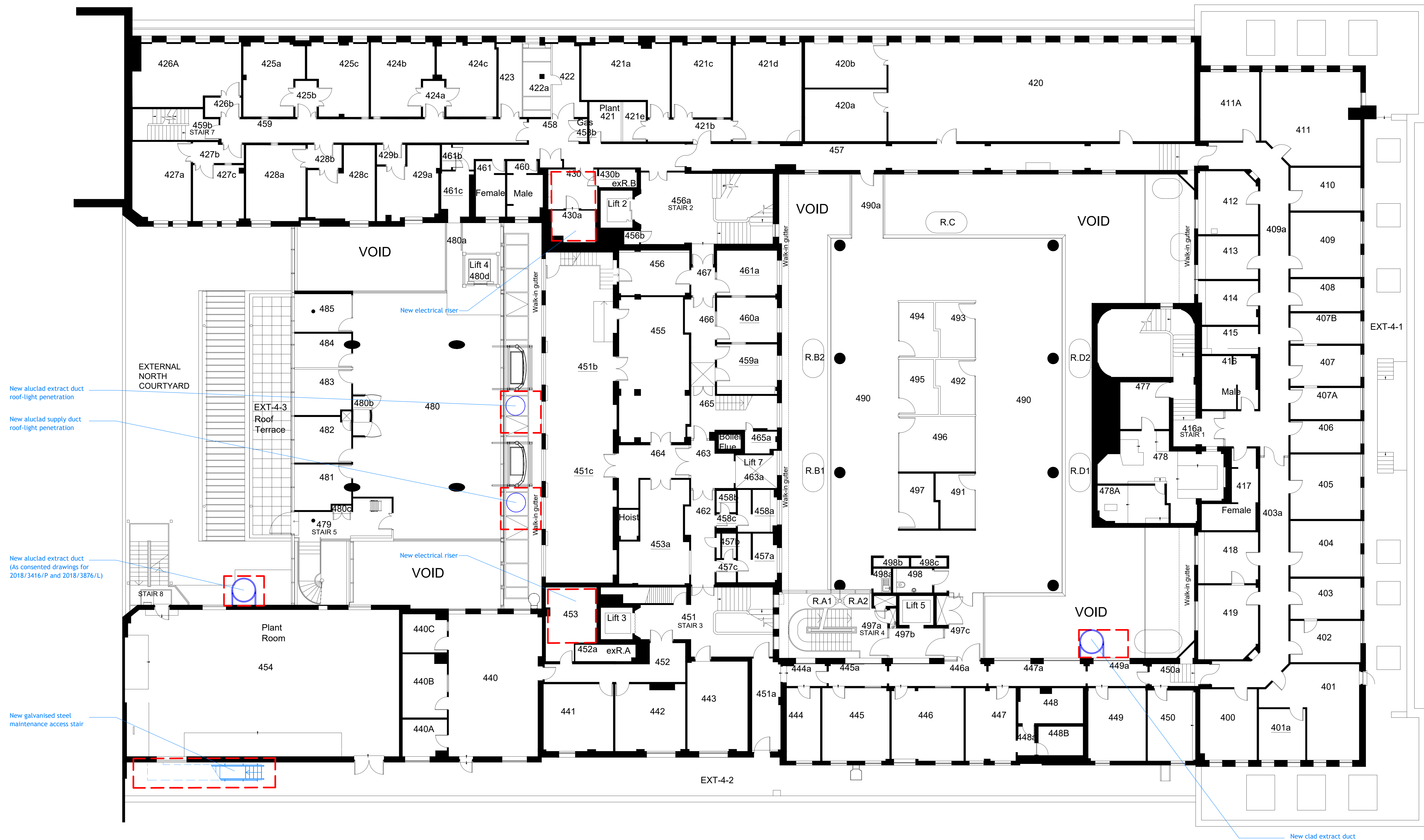
01 Proposed Level 04 Plan 08-2004 Scale = 1:100

REVISIONS: 1. Level 4 to 5 stair revised