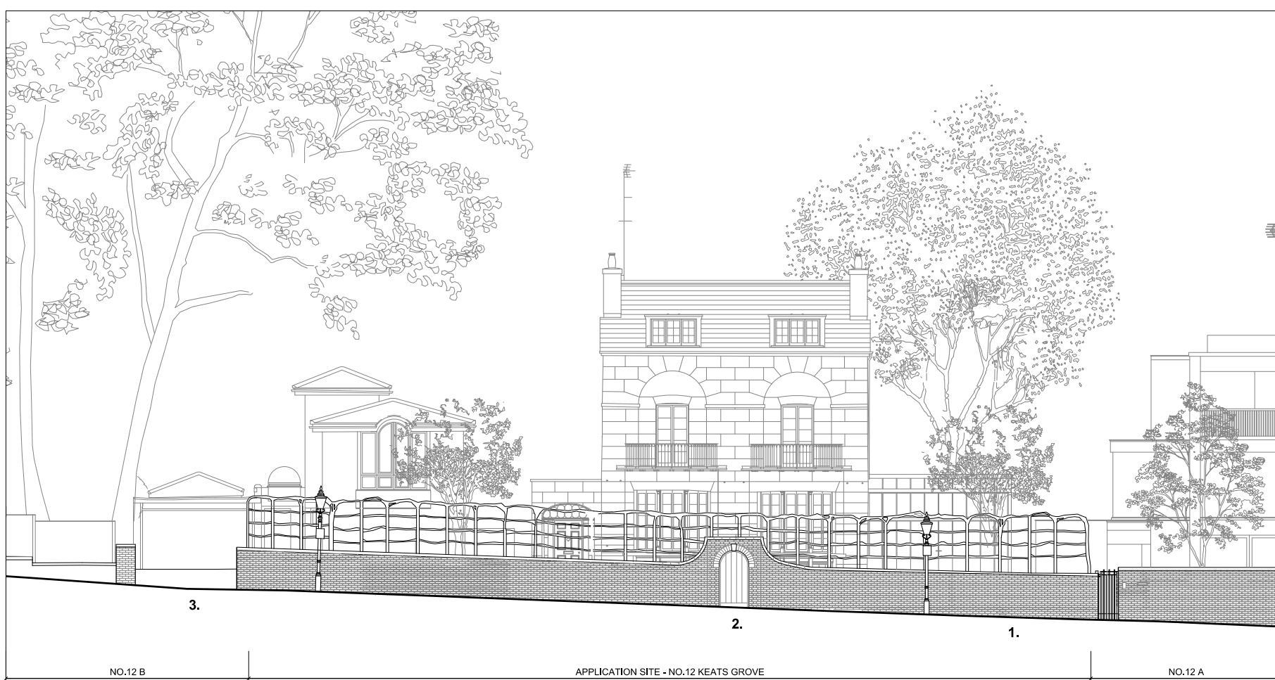
2 1:100 / 1:200 PROPOSED FRONT BOUNDARY ELEVATION

0 1 2 3 4 5 6 7 8 9 10 SCALE IN METRES @ 1:100