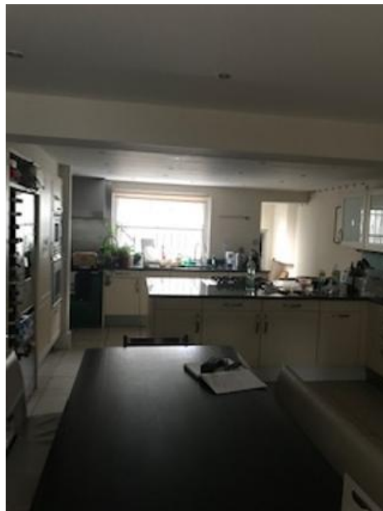
Lower Ground Kitchen Area