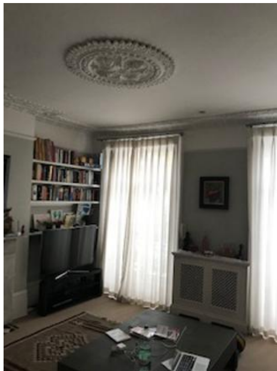
First Floor Living Room