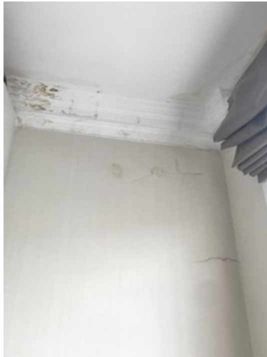
Damp Staining to Second Floor Front Bedroom