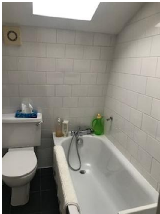
Top Floor Bathroom