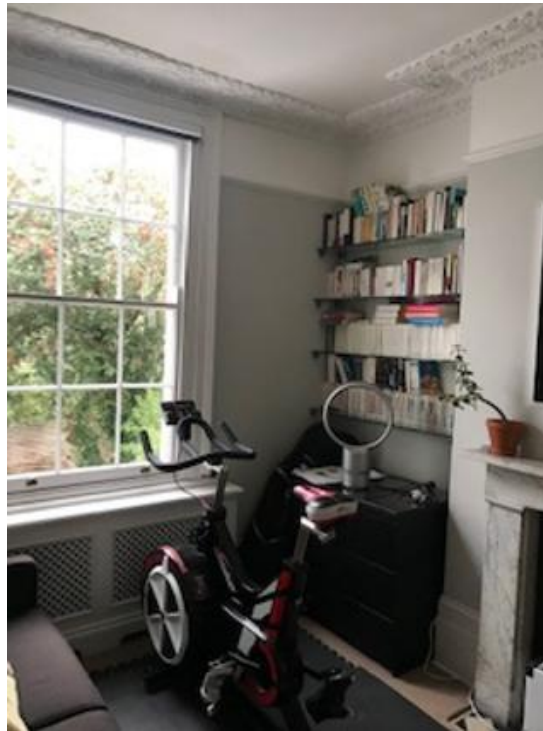
First Floor Rear Room