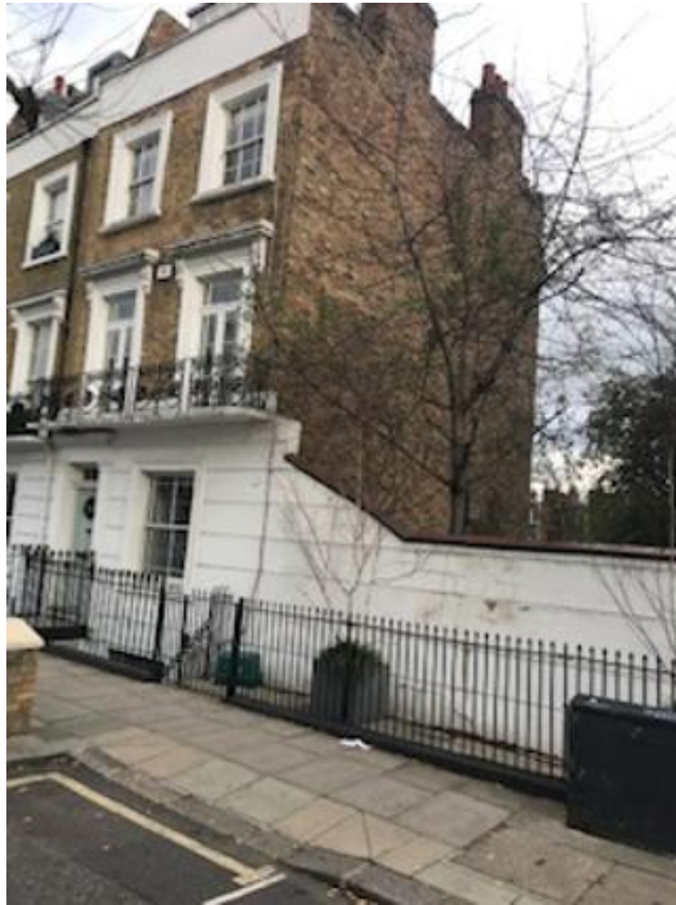
Flank of Property