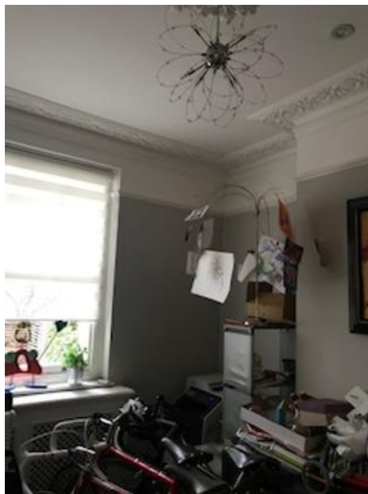
Ground Floor Rear Room