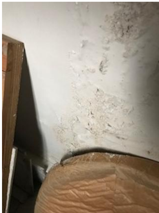
Damp to Vault Area