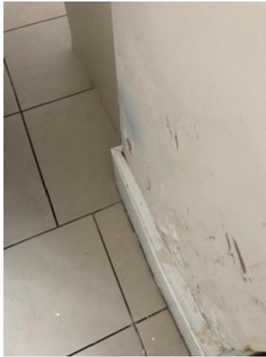
Damp to Lower Ground Floor Kitchen