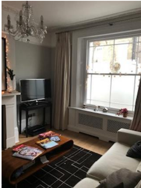
Ground Floor Living Room