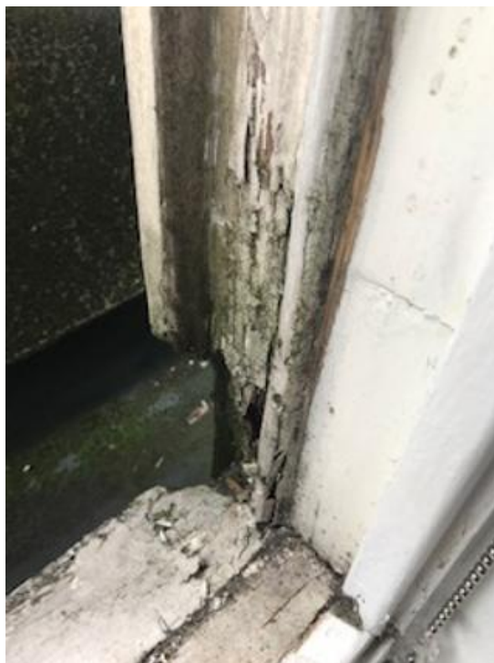
Rot to Top Floor Window