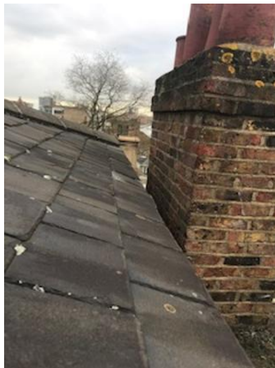
Chimney to Flank