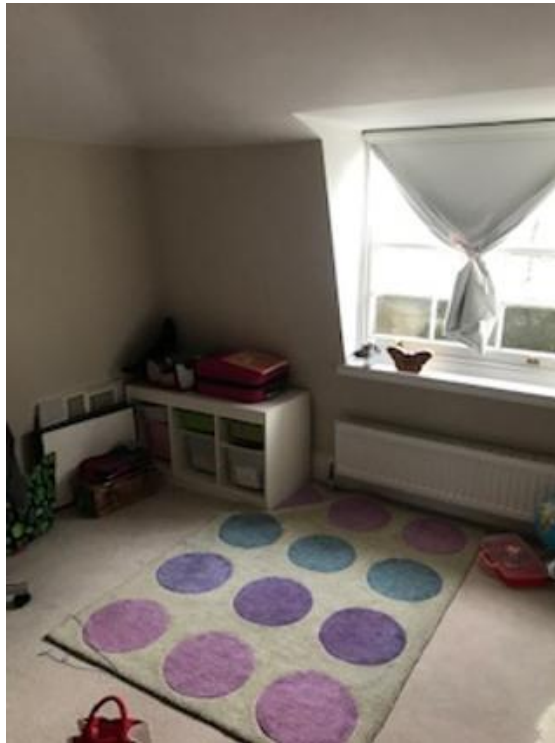
Top Floor Bedroom