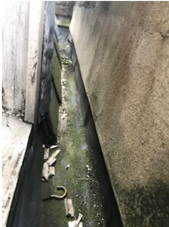
Box Gutter to Flank