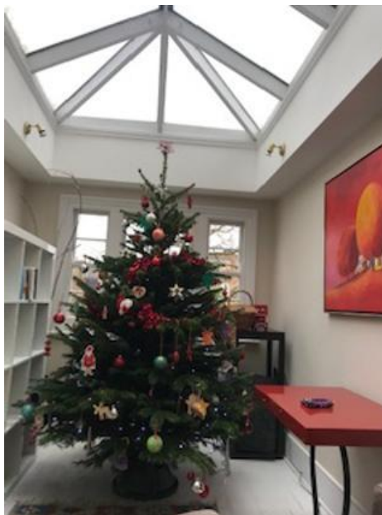
First Floor Conservatory