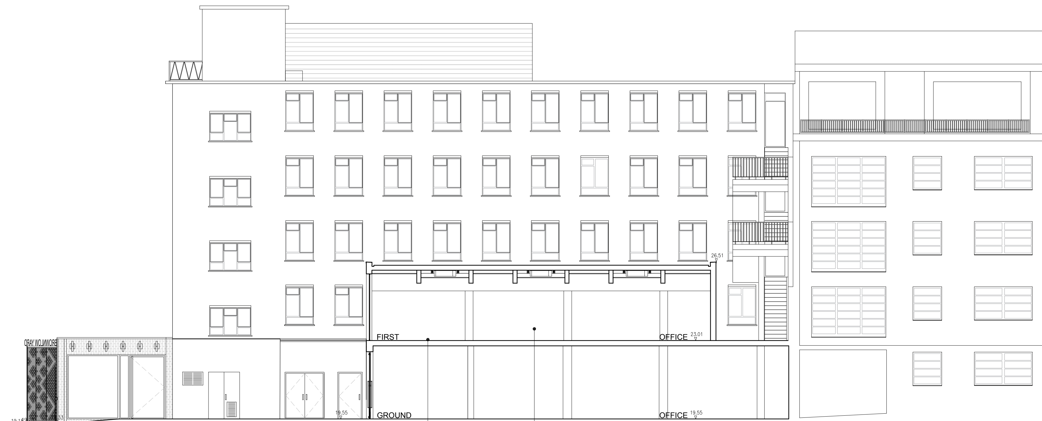
1 PROPOSED SECTION B-B 1:100 @ A1

Level access between existing and proposed first floor plate. Proposed extension to first floor, timber construction with exposed Glulam beams. Constructed onto existing ground floor roof slab.