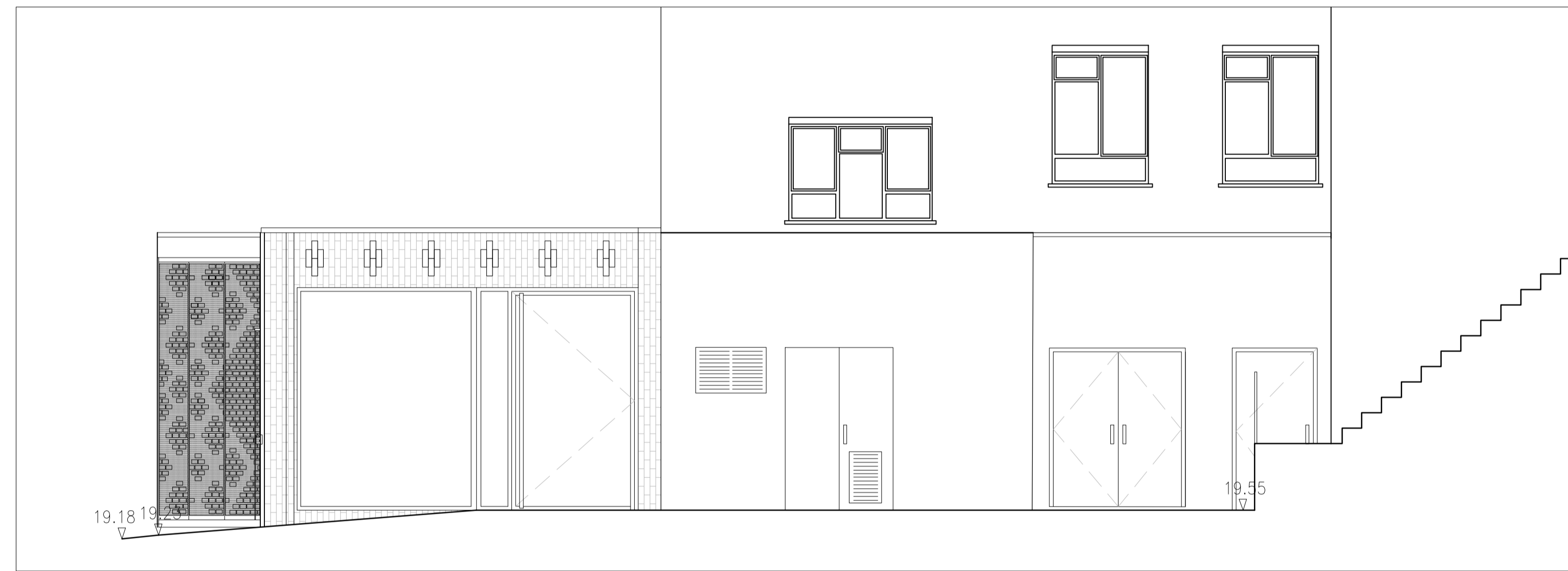
2 A-A SECTION 1:50 @ A1