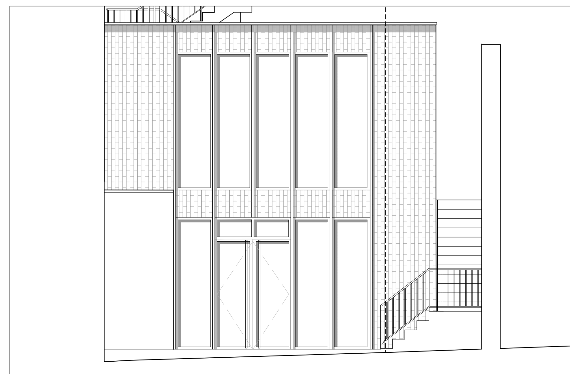
4 C-C SECTION 1:50 @ A1