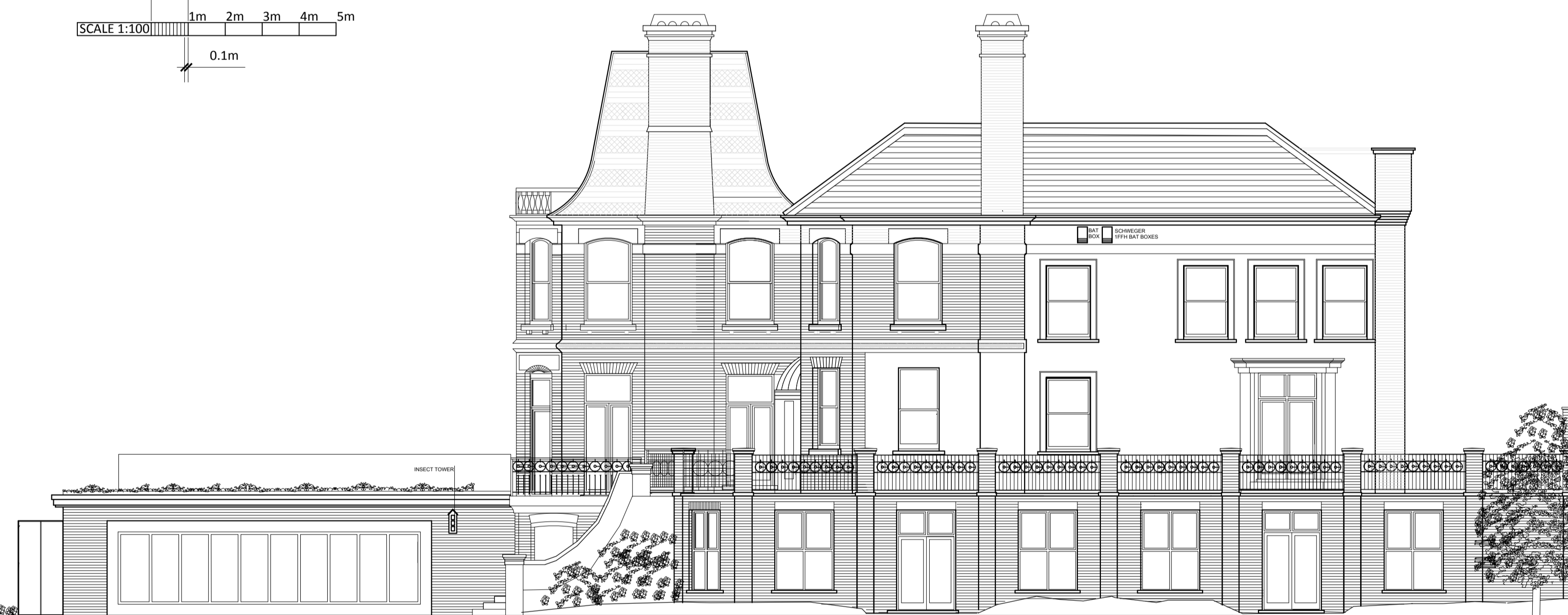
EAST ELEVATION TO PLAY LAWN