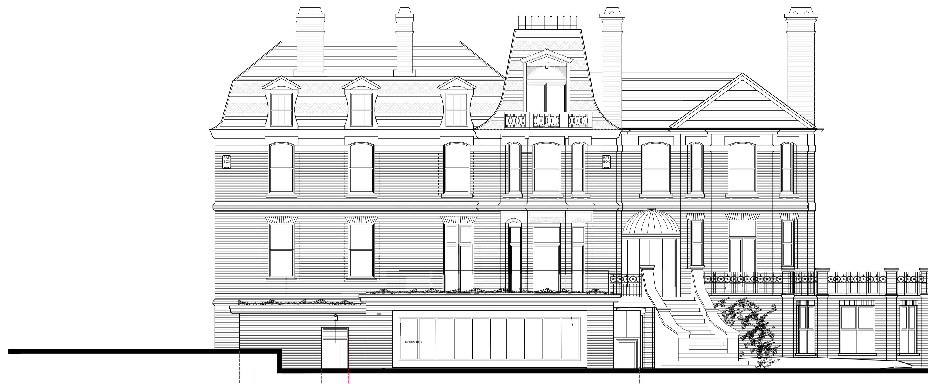
SOUTH ELEVATION TO WATERLOW PARK

Notes: Do not scale from this drawing. Contractor to take and check all dimensions on site before work commences. Discrepancies to be reported to architect. Subcontractors to verify all dimensions on site before making shop drawings or commencing manufacture. This drawing is copyright.