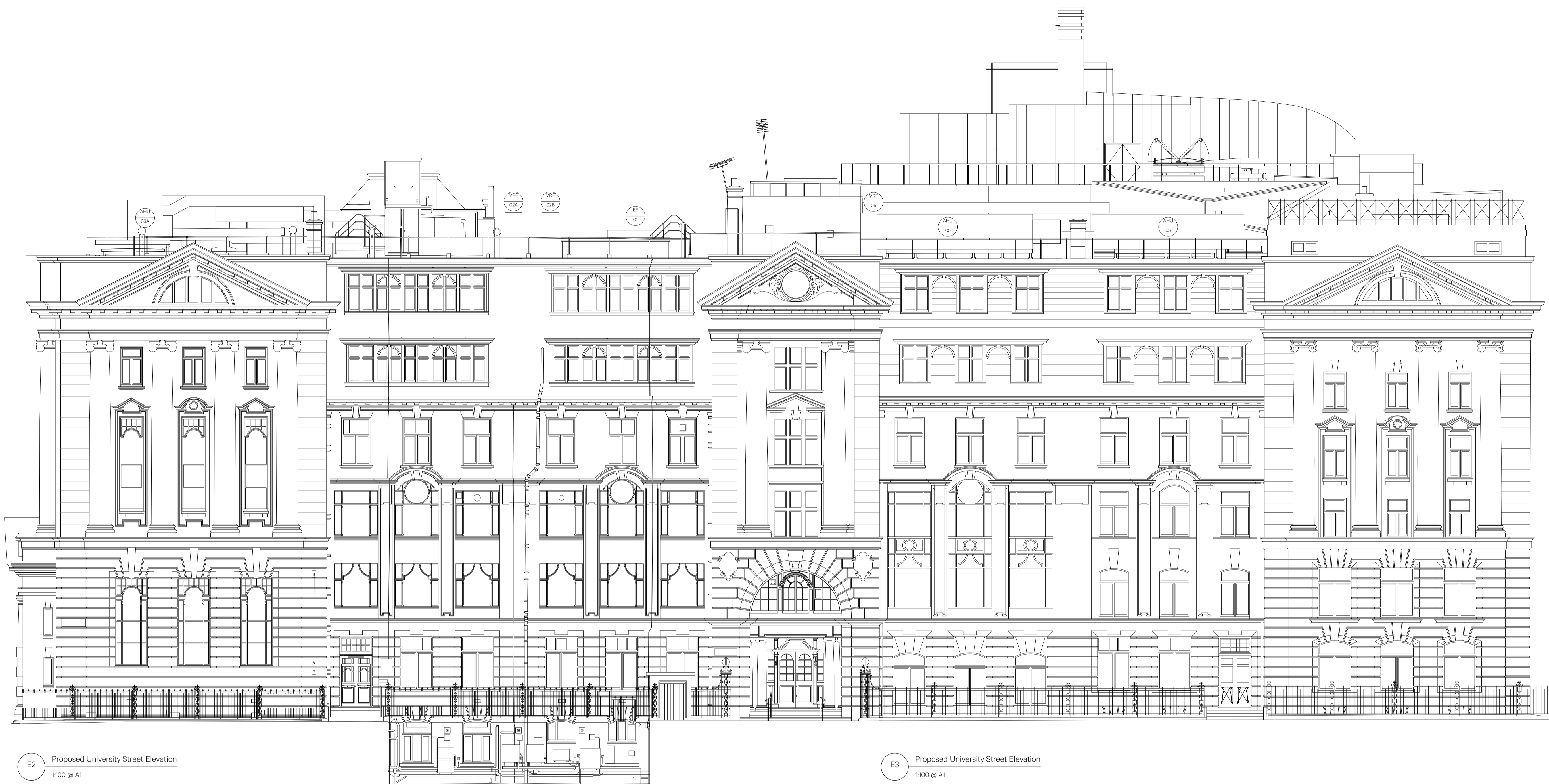
E2 Proposed University Street Elevation 1:100 @ A1