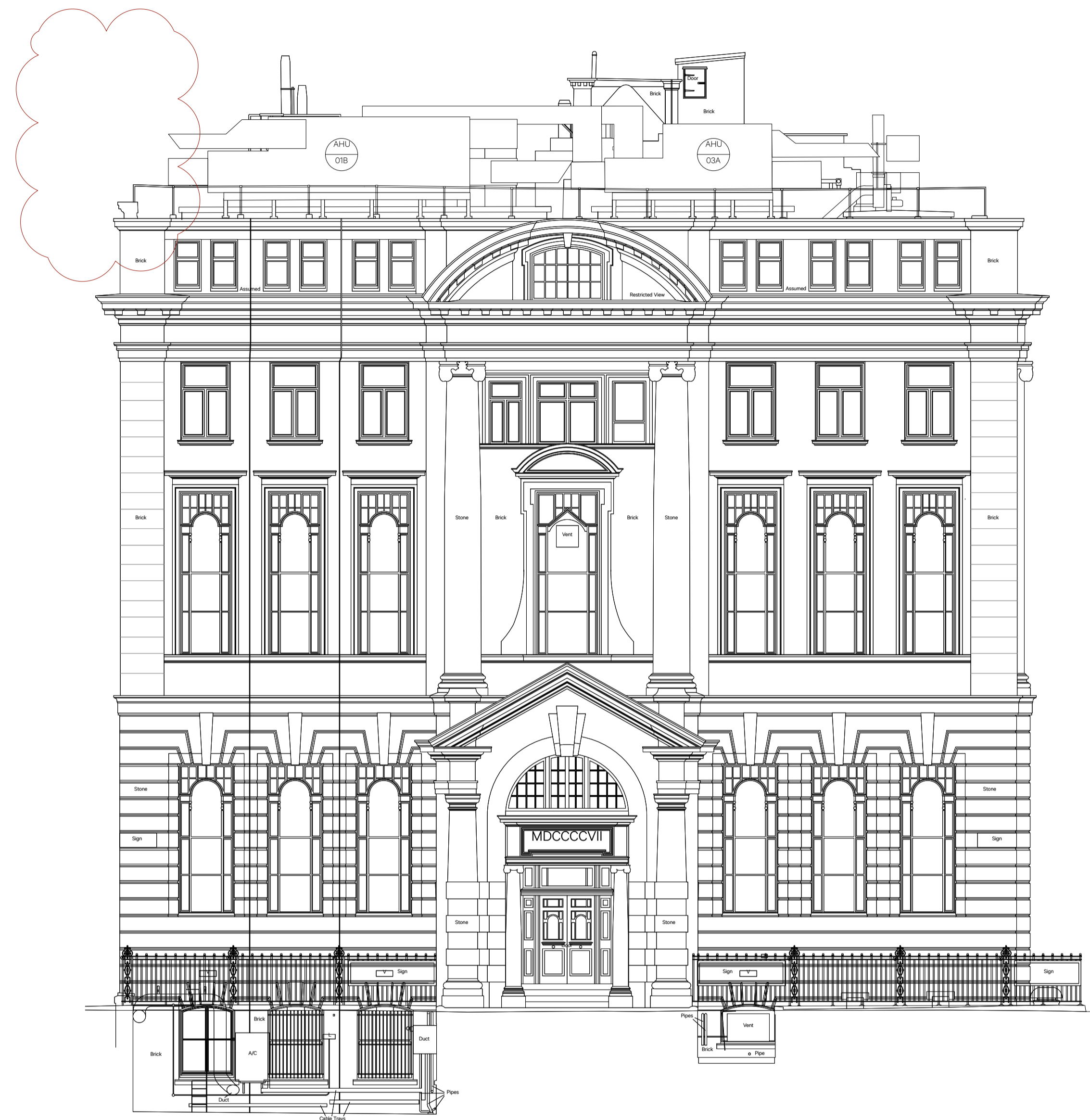
E1 Proposed Gower Street Elevation 1:100 @ A1