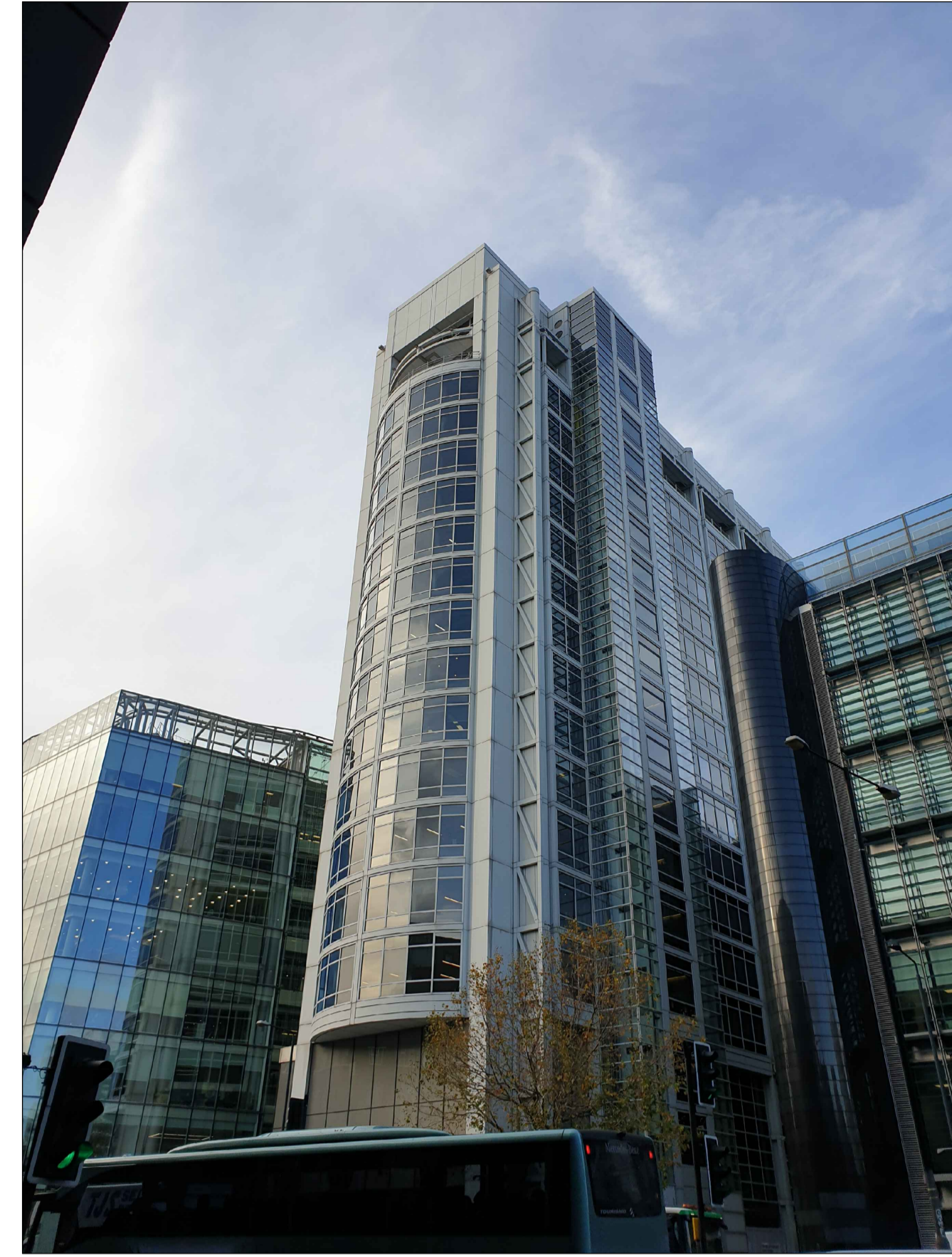
EXISTING SOUTH FACADE