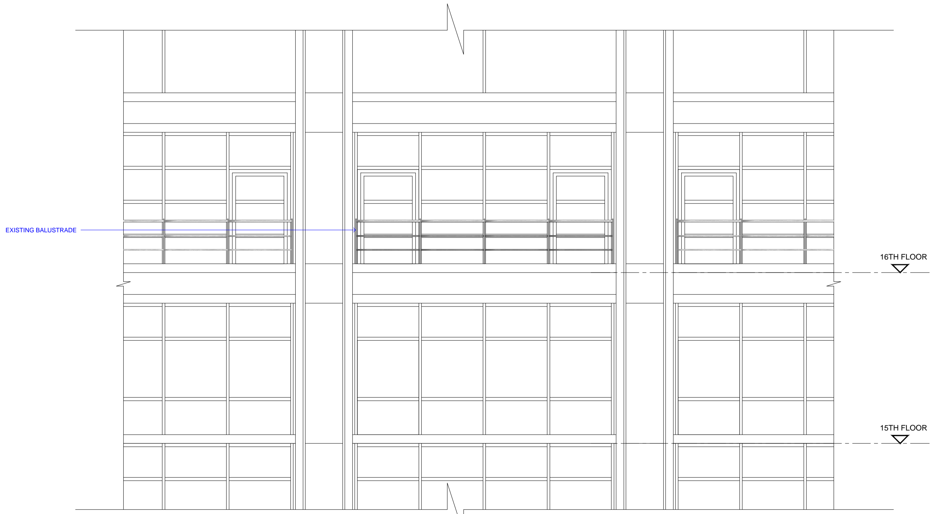
B ELE EXISTING WEST ELEVATION 1:50 @ A1