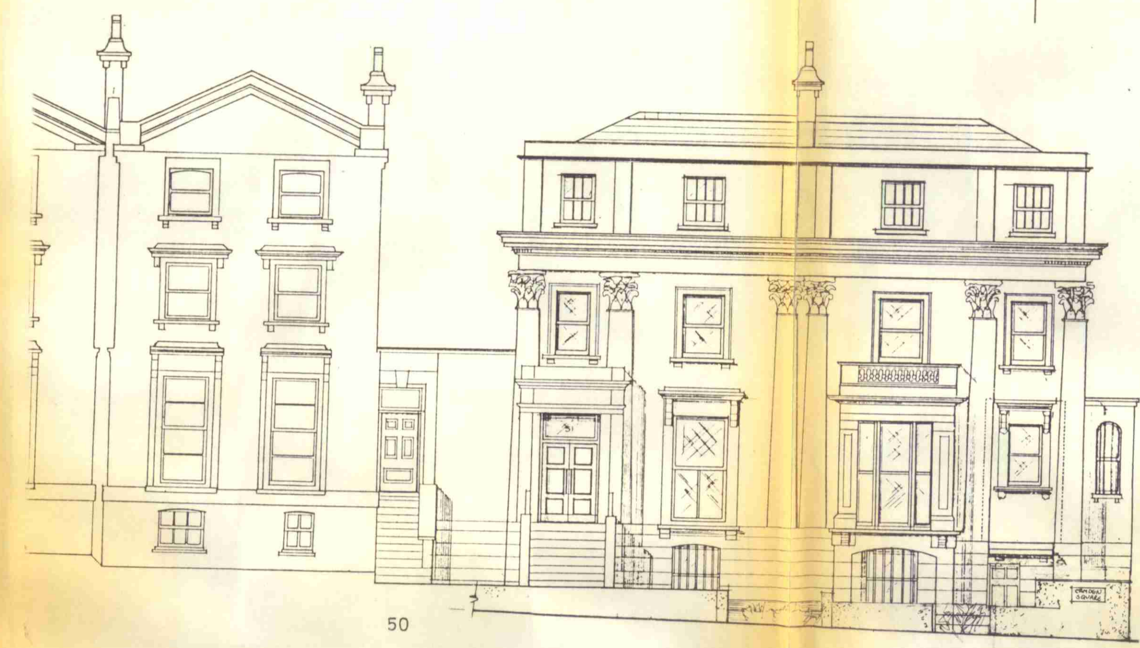
CAMDEN SQUARE ELEVATION 1:100