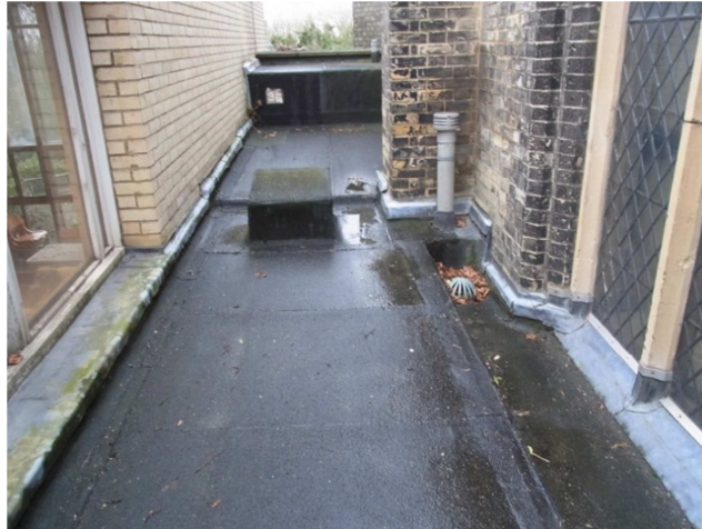
Link roof, view towards the back (East)