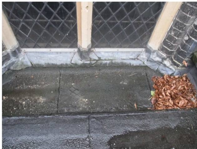
Link roof, window sill and catchpit