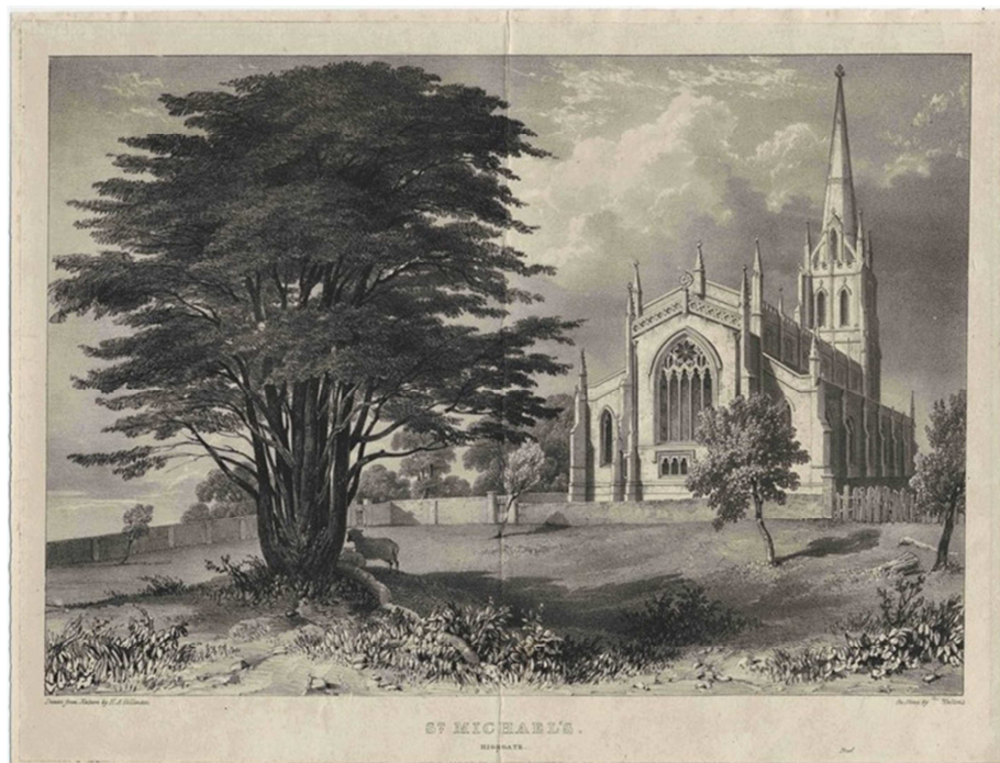
A drawing of St Michael's Church from around 1832, before the cemetery existed.