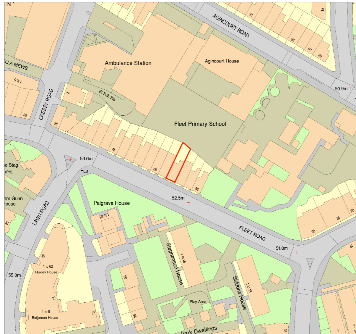
OS Map 1:1250

PL.04 Proposed Floor Plans PL.05 Proposed Front and Rear Elevations PL.06 Existing & Proposed Sections