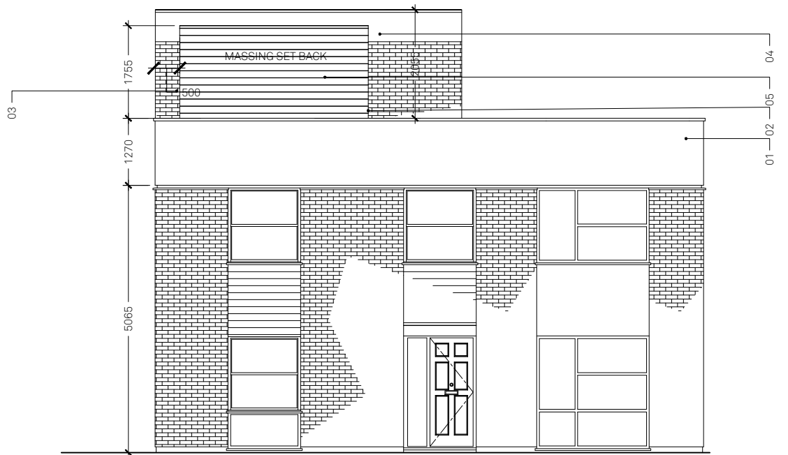
02 PROPOSED FRONT ELEVATION 1:100