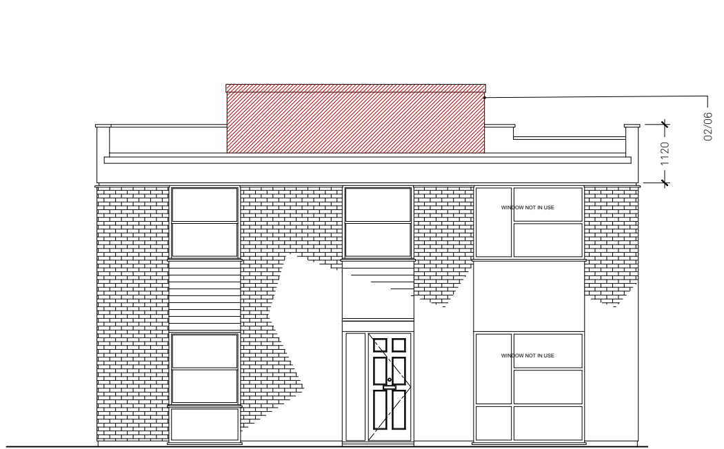
01 EXISTING FRONT ELEVATION 1:100