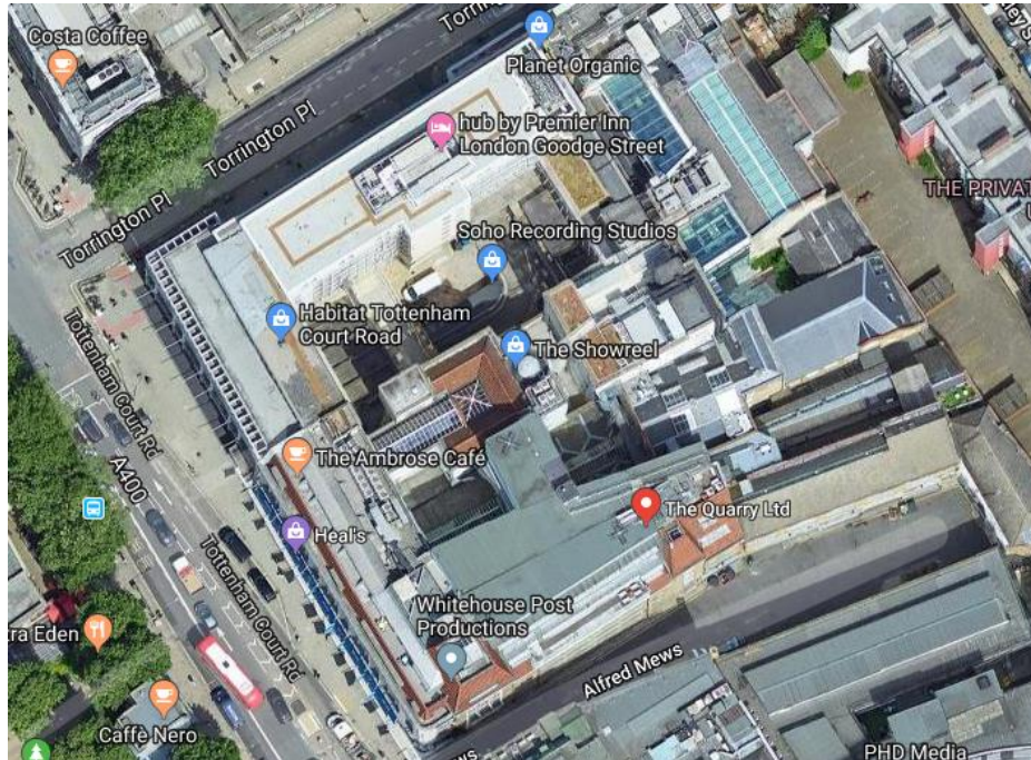
Aerial view of The Heals Building located at 196 Tottenham Court Road.