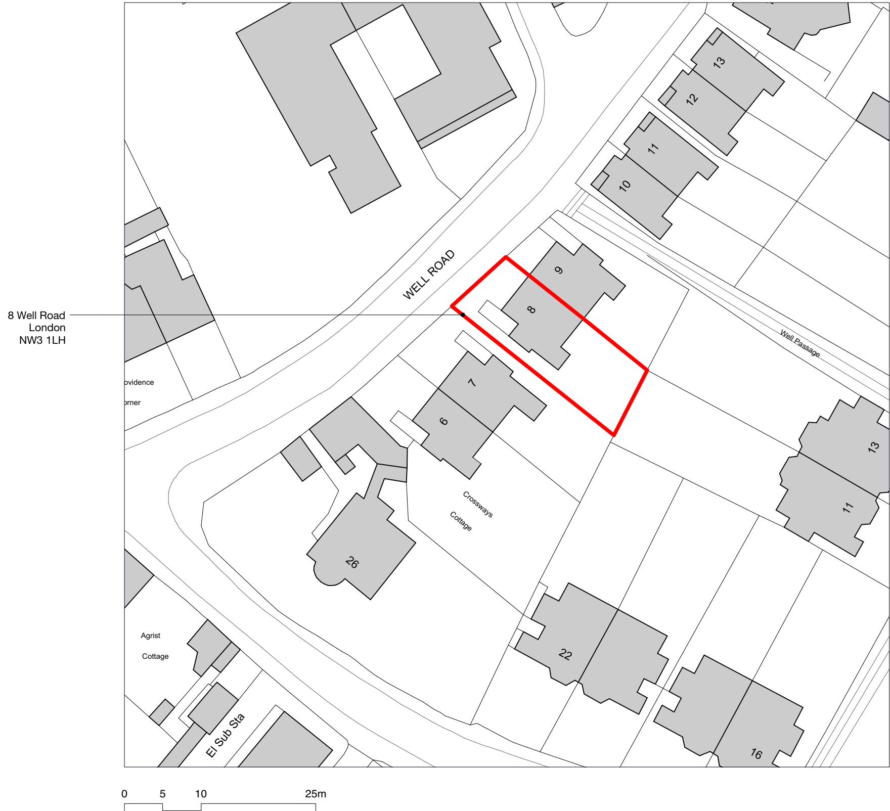
SITE BLOCK PLAN AS EXISTING SCALE 1:500 @ A3