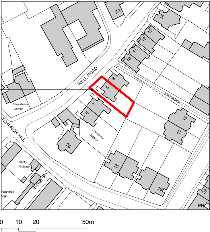
LOCATION PLAN AS EXISTING SCALE 1:1250 @ A3