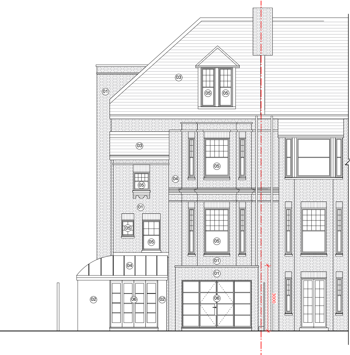
REAR ELEVATION AS PROPOSED SCALE 1:100 @ A3